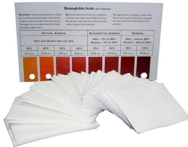
Figure 1. Tallquist haemoglobin scale [11].