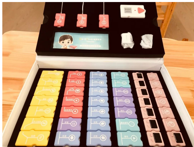
Figure 4. Handy Block programming blocks.