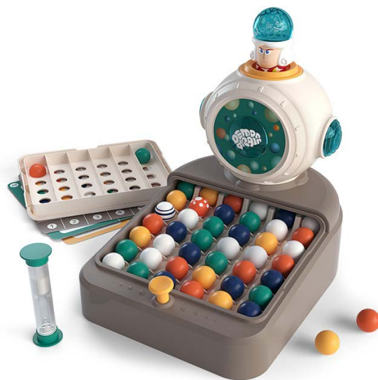
Figure 2. Eliminate ball.

The Spiel Welle scientific exploration drilling machine ( Figure 3 ), by combining the engineering teaching characteristics of DIY and STEAM, children can