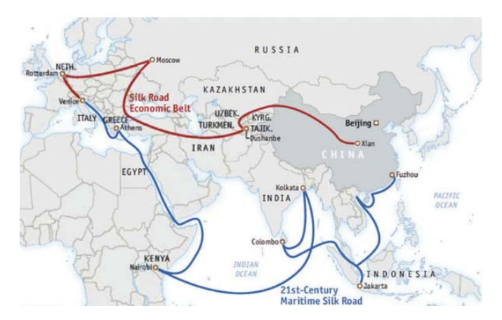
Figure 1. Map of the Belt and Road initiative of China.

Khaukpyu port of Myanmar, Maldives port, Sudan seaport, and Gwadar port of Pakistan are connected with Hong-Kong seaport and Ningbo seaports of the southern part of China. It also enters into Mediterranean Sea to connect economic belt at Venice, Italy [15]. So many small projects are being implemented under the main megaprojects for construction of the economic zones, seaports, gas and oil pipelines, roads, bridges, railways, canals and industrial zones for facilitating interconnection among distant regions of Asia, Europe and Africa [16]. So, it is a way to promoting economic development of some developing countries of Asia and Africa. Up to May, 2017 about 70 countries and international organizations already have signed for BRI initiative [17]. There are so many queries of people related to the projects under BRI since China is not willing to publish a complete list of projects. Up to 2013, about 50 Chinese SOC (state owned companies) have invested about 1700 small projects under BRI. Official Development Assistance (ODA) projects are designed to support for building infrastructure to member countries. China initiated Asian Infrastructure Investment Bank (AIIB) for providing investment support to BRI.