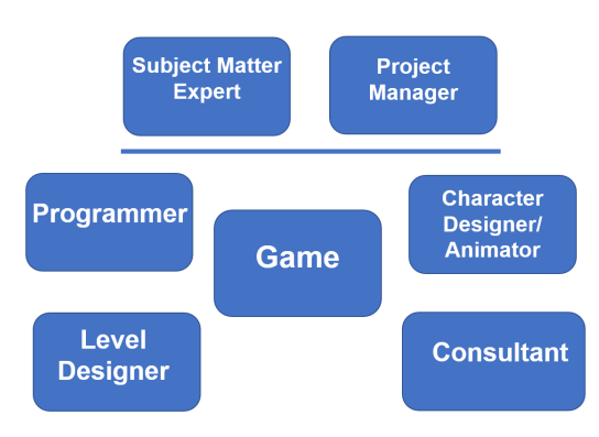
Figure 4. Hybrid team diagram.