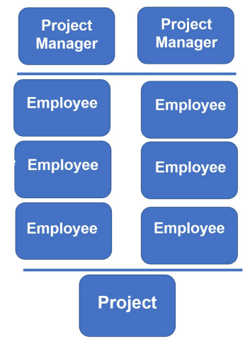
Figure 3. Matrix team diagram.