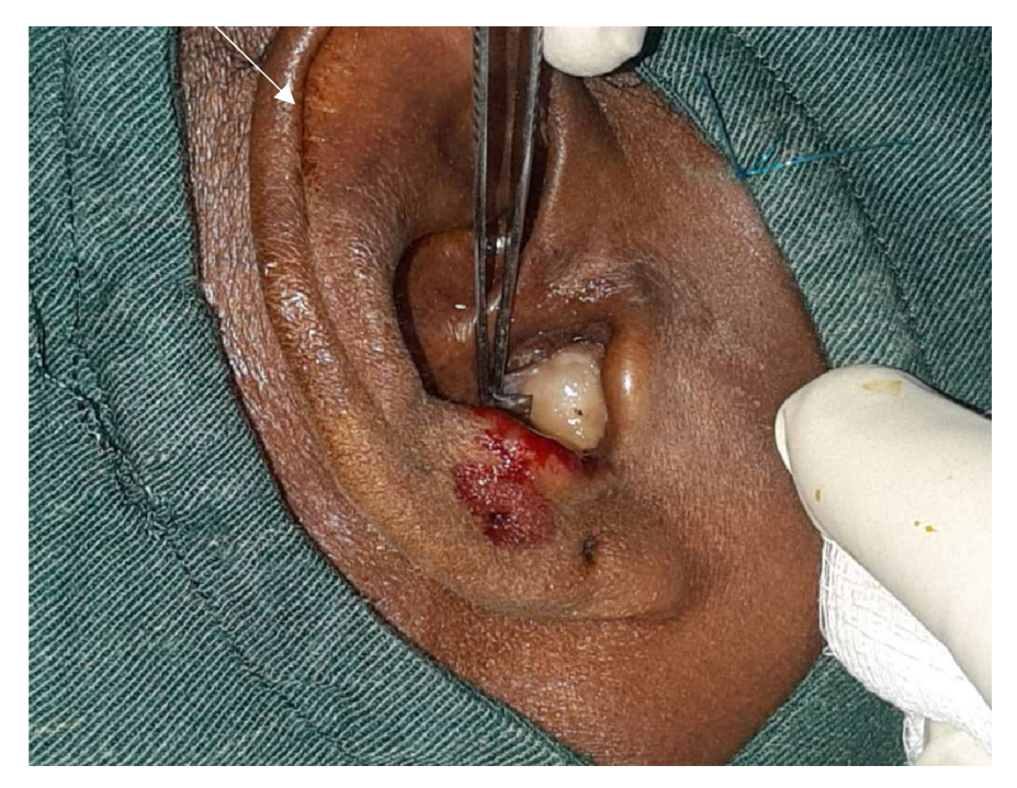
Figure 1. Well-limited white mass after exposure.

The mass was surgically removed, through the canal approach, under general anaesthesia. The tumour appeared white upon contact with the cartilaginous duct (Figure 1). The postoperative period was uneventfull. Pathological examination revealed a neurofibroma characterized by a tumor proliferation consisting of bundles of fairly regular, spindle-shaped cells. Their cytoplasm is eosinophilic and their nuclei elongated with tapered ends (Figure 2). After three years of follow up, there has been no recurrence.