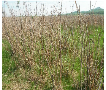
Willow growth in 2018