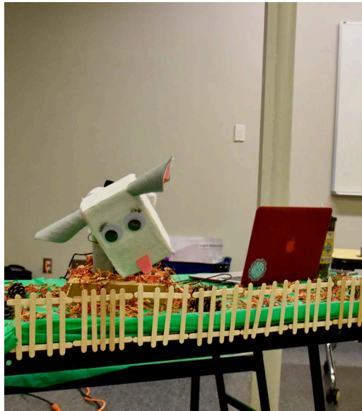
Figure 1. Digital petting zoo.

Towndrow (2016) argue for a less integrated approach positing that classroom activity revolves around problem-solving with computational thinking as knowledge development. It is critical that we address the phenomenon of technology rich but curriculum poor commonly found in economically disadvantaged schools (Ryoo et al., 2013). Schools, teachers, or students may have access to specific technologies, but these have not been aligned to curricular focus, or educators have not intentionally identified them as critical necessities. Without supportive programming, professional development, and curricular alignment, technology sits idle or only serves in a substitution capacity for traditional instructional delivery models. Specificity, intention, and expertise are required by educators in the utilization of technology to establish computational thinking structures in young children (Jaipall, Jamanii, & Angeli, 2017).