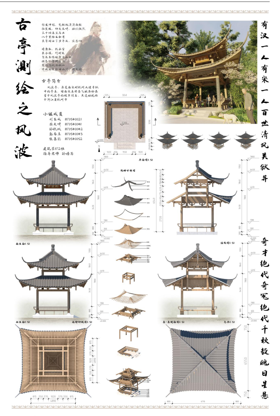
Figure 1. "Feng Bo Ting" pavilion.