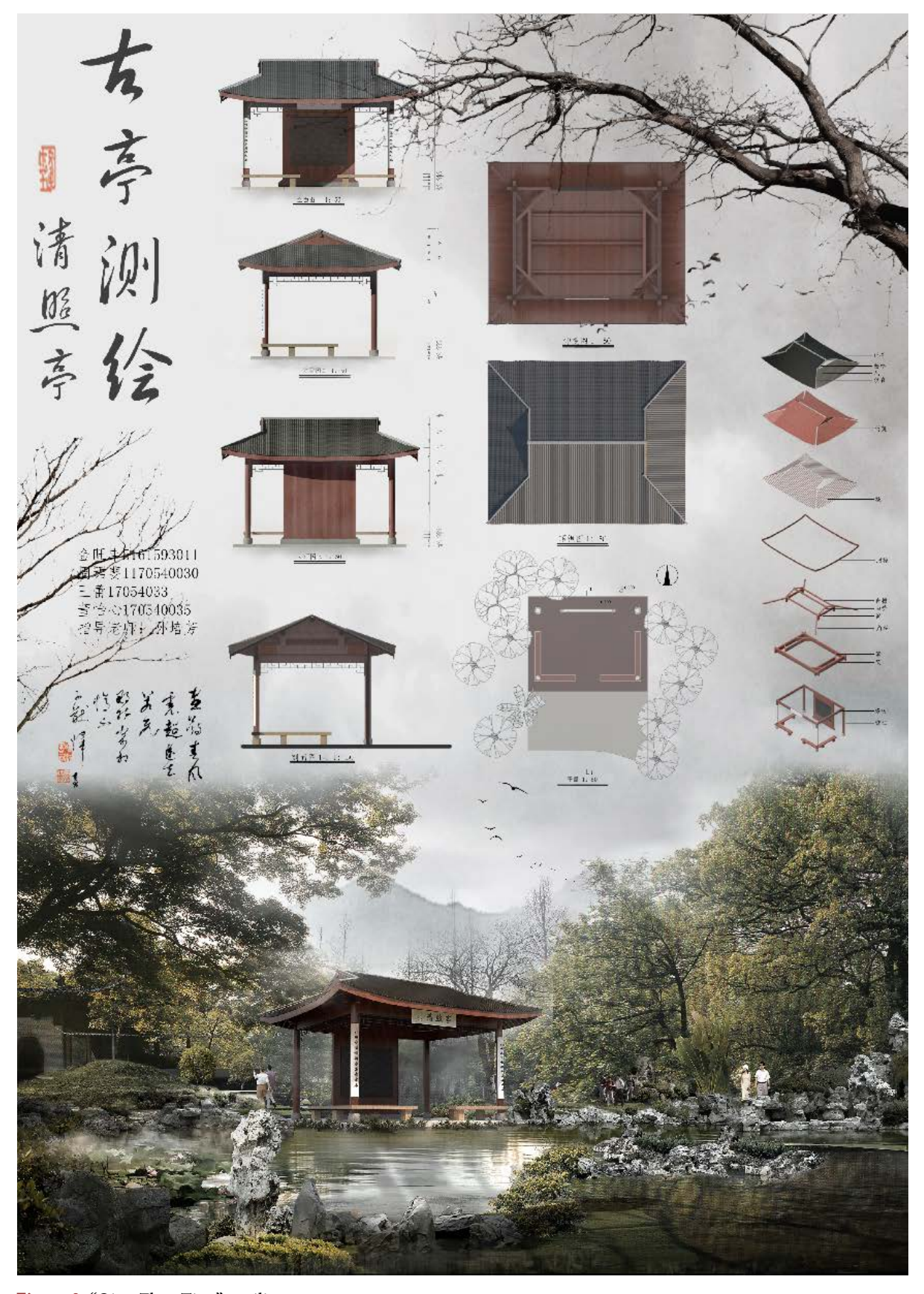
Figure 2. "Qing Zhao Ting" pavilion.