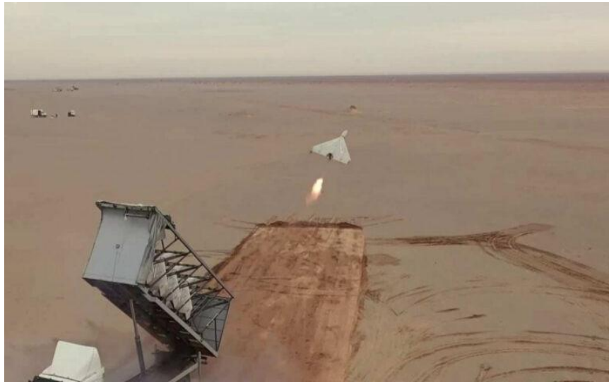
Figure 3. The take-off of a Shahed 136 [27].