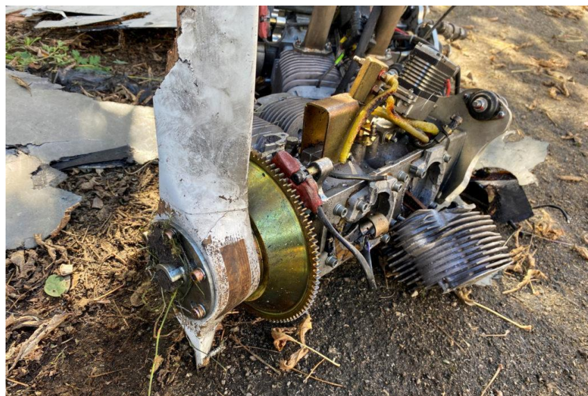
Figure 2. The piston engine used in the Shahed 136 [27].

Although this range is still being disputed and can still be lower than the initial thought, it is nevertheless an incredible range and endurance. This range makes the Shahed on par with most state-of-the-art loitering munition, such as the Hero family and long-range IAI Harop. For comparison, some cruise missiles currently deployed by Russia, for instance, the 3M-14 Kalibir and Kh-55, have respectively 2000 and 2500 km in range [28].