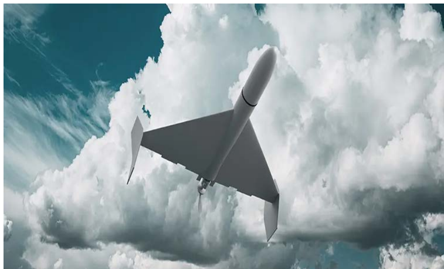
Figure 1. A Shahed 136 mid-flight [27].

Another strong point for the Delta wing is that it has a high-volume efficiency, meaning more can be held giving a certain storage volume, facilitating transportation and logistics to overwhelm enemies' defenses by sheer number.