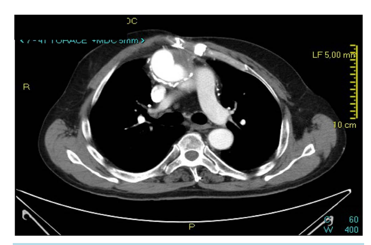
Figure 2. Control CT scan after the repair.

As for the aneurysms, the mortality is essentially related to the increase in size and to the serious complications that may occur (rupture, fistula, compression of local structures and thrombosis) [4] [6] [7]. This risk can be reduced by achieving an early diagnosis. In the majority of cases this is obtained during routine periodical clinical and instrumental imaging controls. The most useful techniques employed to discover a false aneurysm consist of transthoracic and transesophageal echocardiography, thoracic angio-CT scan, angio-MR and aortography [6]. These techniques allow for accurate diagnosis and consequently lead to the most appropriate surgical approach.