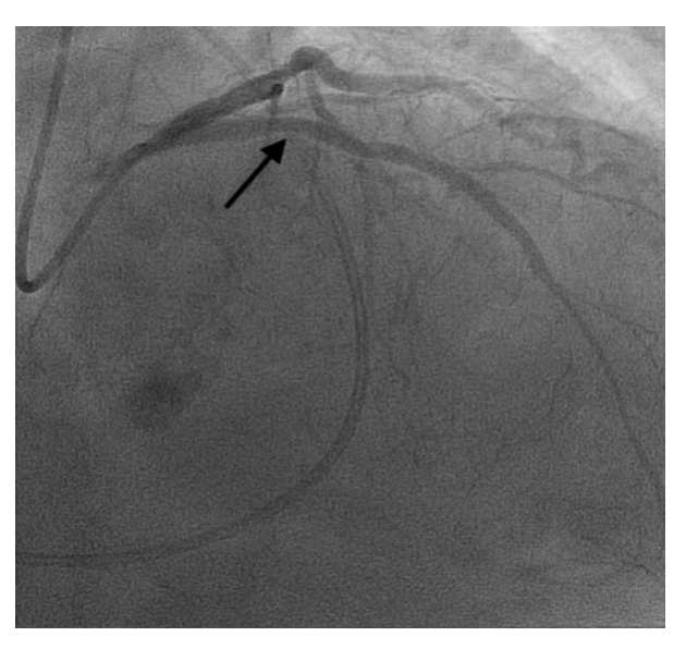
Figure 2. Coronary angiography showing no residual stenosis in the stented segment (arrow).