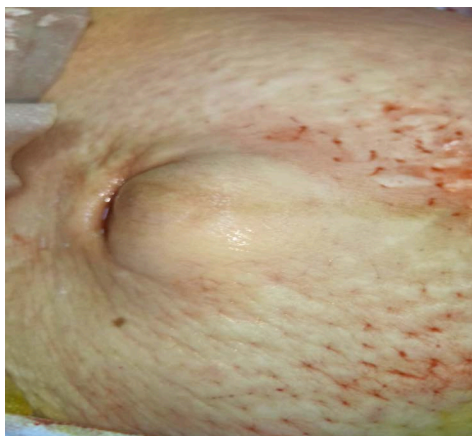
Figure 1. A preoperative appearance of umbilical hernia in a pregnant woman.

them at presentation [6]. In our study we assessed the value of performing paraumbilical hernia repair during CS using a single incision, comparing such approach with paraumbilical hernia repair during CS using 2 incision one for the CS and one for the hernia repair, and with of performing elective paraumbilical hernia repair later on after complete healing of the CS scar. We have found that performing paraumbilical hernia repair during CS using a single incision was the best approach of management that resulted in no increase in complications (notably infection) over other compared procedure. Additionally, our patients were cosmetically, clinically and financially highly satisfied with the combined procedure.