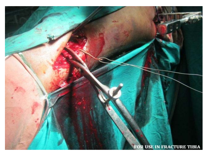
Figure 2. Intraoperative picture with "Suyash" wire passer passed around the bone.