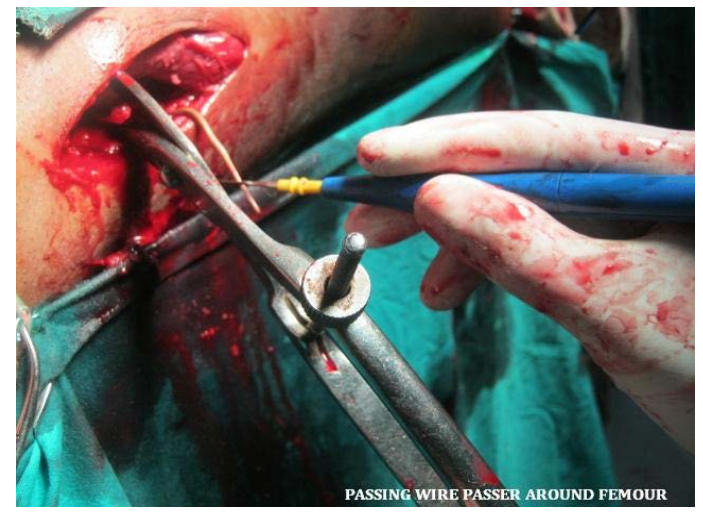
Figure 1. Intraoperative picture with "Suyash" wire passer passed around the bone.

The authors have found that this instrument (Figure 3) is useful for all long bones fractures especially in comminuted subtrochanteric femur fractures while performing the cephalo medullary nailing. It is especially useful during arthroplasty if the calcar breaks. It is particularly useful in the tendon fixation to bone using the suture pull out technique. Performing a tension band wire fixation in difficult cases is easy with this instrument.