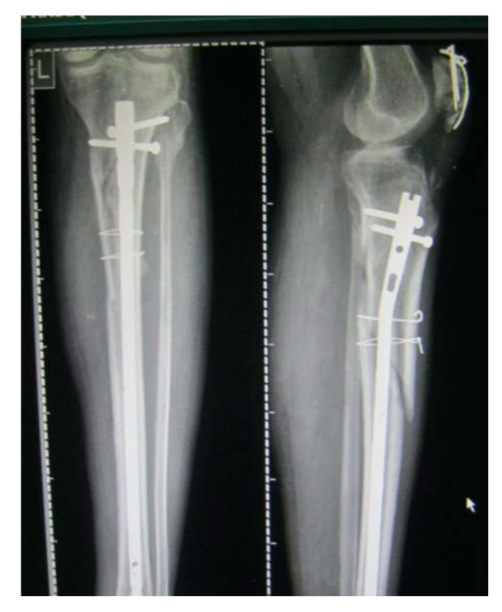
Figure 5. Final fixation with Intramedullary nail in situ provisionally fixed with acerclage wire and IMN.

demonstrate that judicious use of cerclage cables to augment fixation of subtrochanteric femur fractures does not have a deleterious effect on healing unless the number of wires are judiciously used and placed.