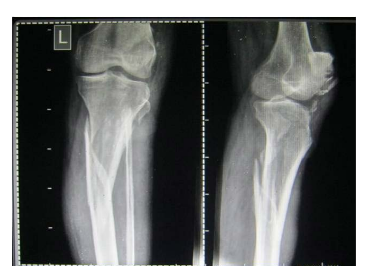
Figure 4. Shows an unstable fracture of the proximal tibia.