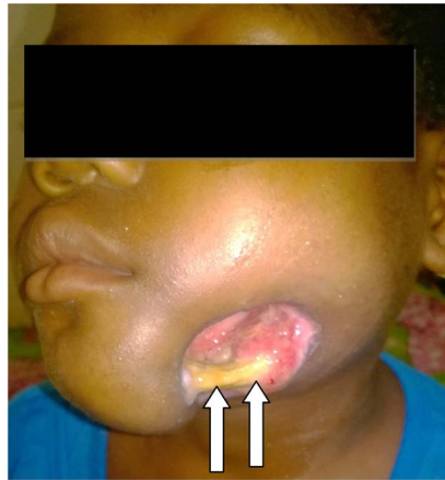
Figure 1. Loss of substance from the left cheek as a large punch, exposing the necrotic mandibular bone.