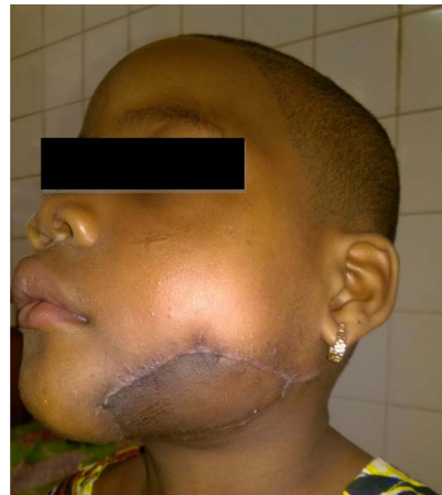
Figure 4. The result 3 months after the surgery.

are consistent with our observation where it is indeed a child from a very miserable family. There is also a notion of malnutrition and poor oral hygiene, including gingivitis and multiple dental caries. Restorative and aesthetic surgery, while sometimes questionable, remains a challenge in developing countries [6] [9]. Our patient, after a hyperprotein and hypercaloric supplementation, benefited of a repair surgery associating a bone rehabilitation by metal plate and the closure of the orostome by a sub-mental flap. The bone repair could ideally have been done with a free flap of fibula, but the technical platform of our service did not allow the realization of such a flap. Bone grafting by an iliac bone graft would be risky given the extent of the necrotic bone (50 mm) and especially the precarious vascular state of the recipient site. In addition, these two techniques include an aesthetic and functional ransom of the donor sites. We preferred the metal plate repair which is simple to perform and saves the inconvenience of bone removal. However, the metal plate has a significant cost, and has no potential for growth in this girl on growing. Several solutions have been proposed for the reconstruction of the losses of substances of the soft parts of the face. Skin grafting cannot be considered here because there is no longer a vascularized