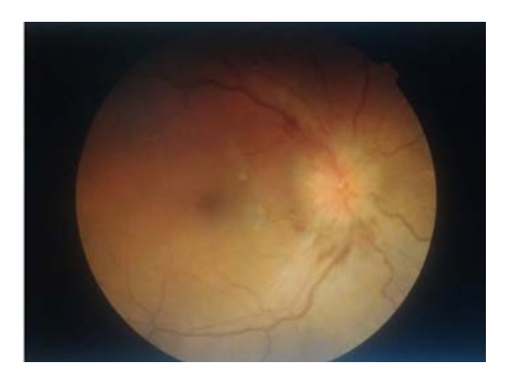
Figure 1. Right eye-blurred disc margins splinter haemorrhages, vascular tortuosity.