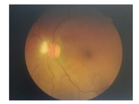
Figure 4. Weeks later-mildtortuosity, no disc oedema, mylinated nerve fibres.

Stevens et al. reported 0.20% incidence of ischemic optic neuropathy after spinal