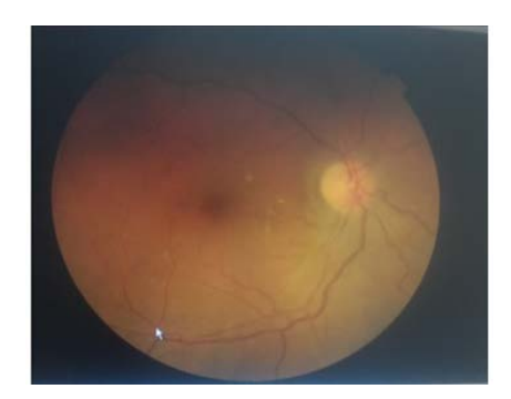
Figure 3. Right eye 6 weeks later mild tortuosity, clear disc margins.