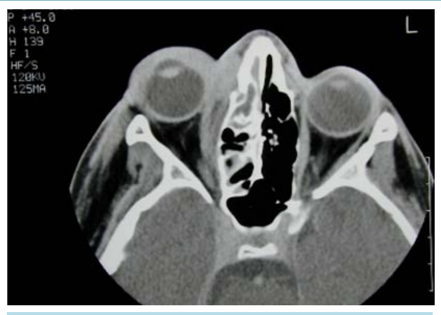
Figure 3. CT image in axial section showing a filling right ethmoid extended to the ipsilateral orbit with subperiosteal abscess and exophthalmia.