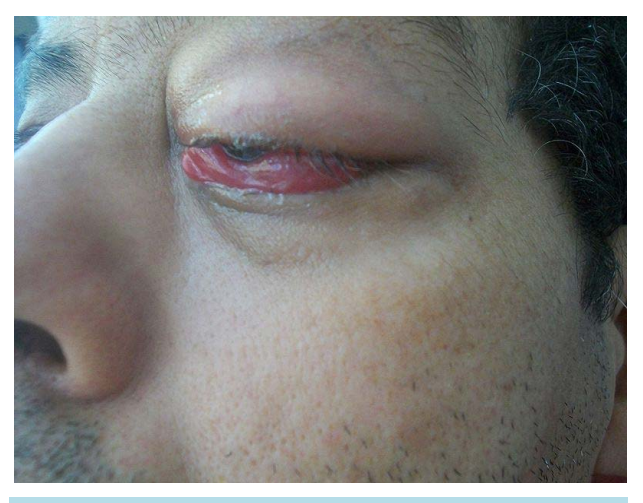
Figure 1. Orbital abscess secondary to a left frontal sinusitis.