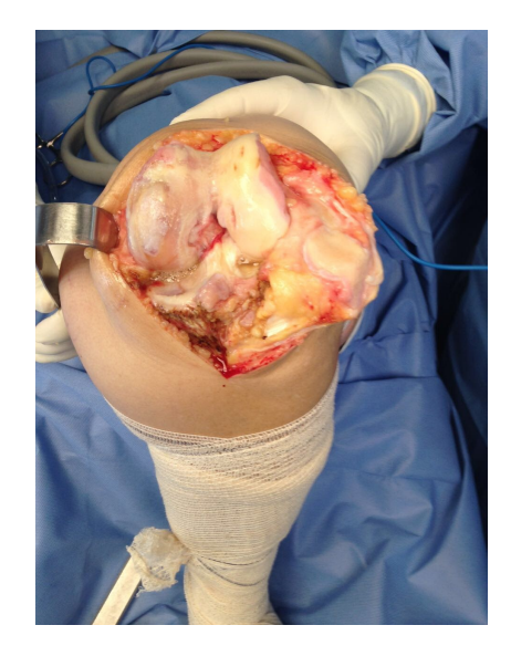
Figure 3. View of support of the femur and tibia, after removal of the prosthesis.