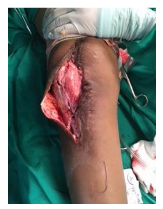
Figure 1. Knee arthroplasty infection. View of soft parts.

For data analysis, a database was elaborated on a Microsoft Excel spreadsheet, which was then exported to the SPSS software, version 18. The percent frequencies were calculated and the respective distributions constructed. For proportion comparison, the chi-square test was applied. In order to evaluate the factors that influenced patient infection, the chi-square test for independence was applied. In cases where the assumptions of the test were not satisfied, the Fisher's exact test was used. All conclusions were determined considering a significance level of 5% (0.05).