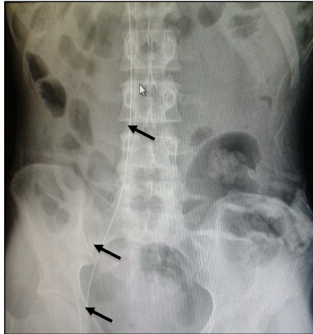
Figure 1. Guide wire in the femoral vein, iliac and inferior cava vein.