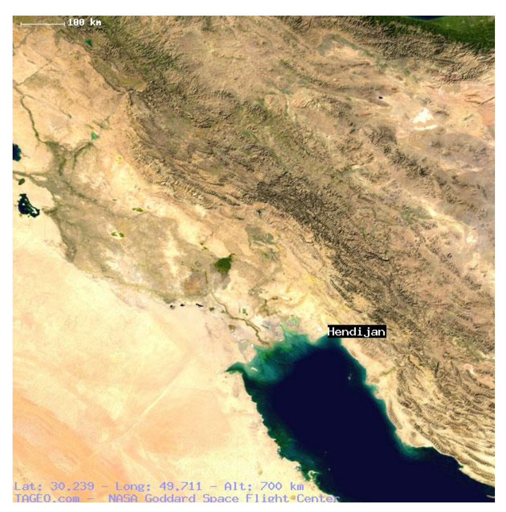
Figure 1. Location map of sampling and overview on sampling sites.

effectiveness and identify the types of pollution index that describes better the quality of the environment. The relationship between indices based on specific taxa Meiofauna with pollutant concentrations, especially polycyclic aromatic hydrocarbons (PAHs) has been accessed [25] and provided a report on the Meiofauna in protected Mangrove forests area in the Persian Gulf. The results showed that the foraminifera were dominant societies. [26] conducted a qualitative study on Mayobentoz in the Persian Gulf. In a qualitative study on nematodes, then, Foraminifera, Cope Poda, Polychaeta and Oligochaeta were dominant, respectively.