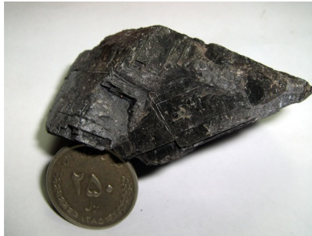
Figure 18. A sample Dolomite in Hormoz Island.

One of the amazing and wonderful geological phenomena of Iran is colourful mountains of Hormoz Island which have created landscape attractions of universe (Figure 20). It is an Island which is natural for geologists and an original scene for artists. What distinguishes Hormoz from other Islands of Persian Gulf is its colourful rainbow soil which has been formed due to diverse rocks and minerals. Thus, most artists design various shapes or carpets with this colourful soil which is unique and outstanding (Figure 21).