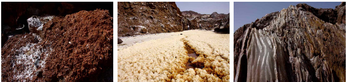
Figure 19. Diverse samples of solved salts and gypsum in Hormoz Island.