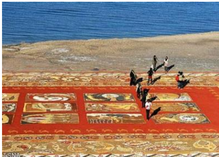
Figure 21. Carpets made of coloured soils of Hormoz.