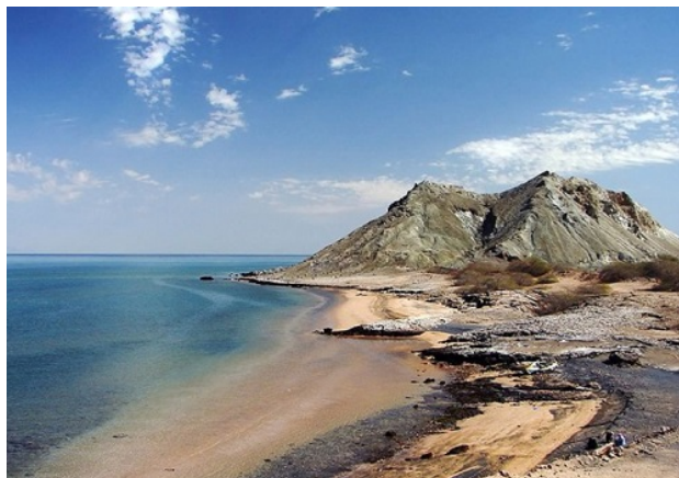
Figure 7. A nice view of southern seashores of Hormoz Island.