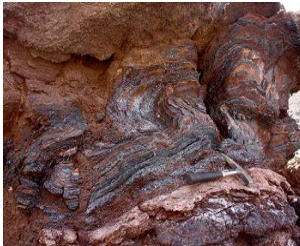
Figure 15. Wrinkled layers containing oligiste.