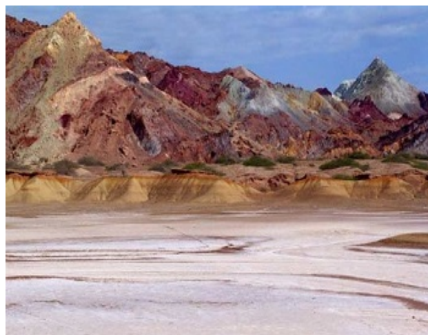
Figure 20. A view of unique diversity of coloured mountains of Hormoz.