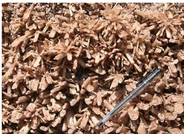
Figure 13. Gypsum beautiful crystals.

Since Hormoz Island is a salt dome, considerable structures of various salt forms can be seen in central parts of Island (Figure 19).