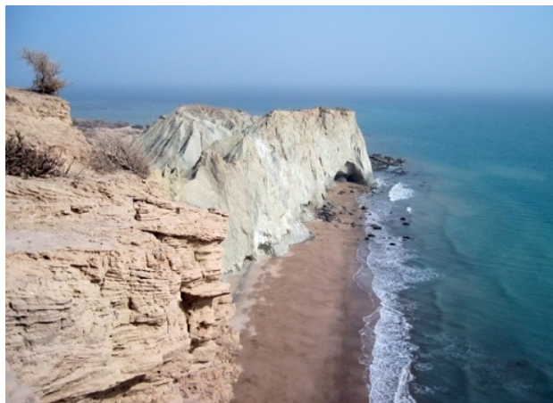
Figure 6. Precipice cliffs and rocks of eastern south of Hormoz (Aghajari formation has creamy colour and Mishan formation is green in farther areas).