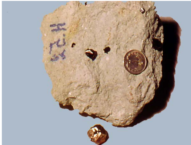
Figure 16. Pyrite crystals.