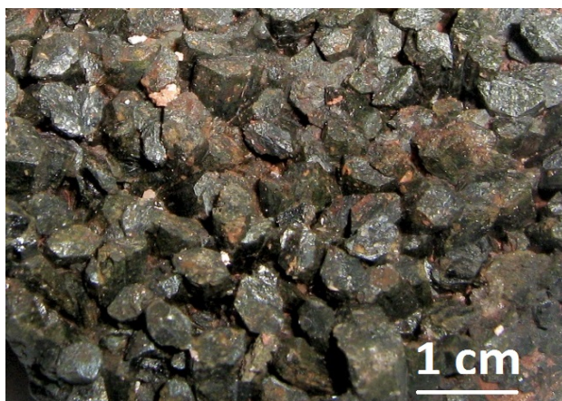
Figure 14. Pyroxene crystals of Hormoz Island.