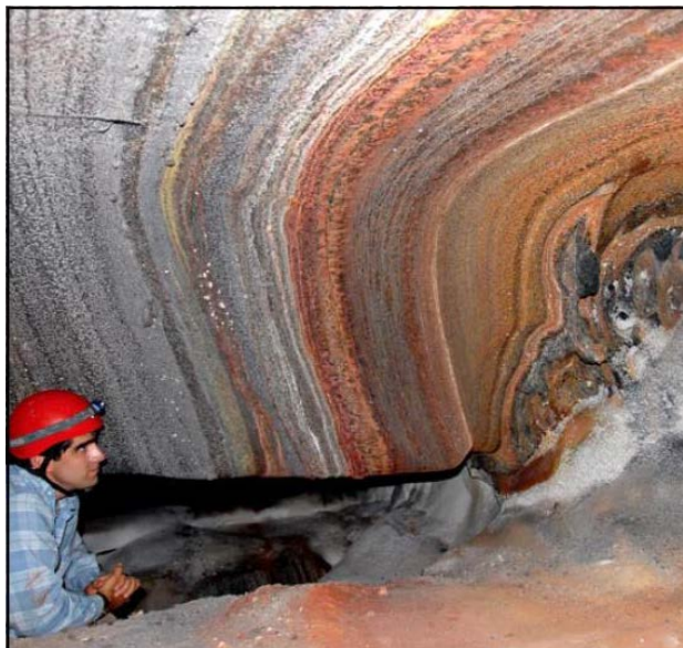
Figure 5. Layering of salt and iron oxide in roof of salt cave of Hormoz salt dome.