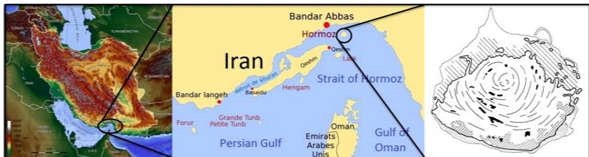
Figure 1. The location of Hormoz Island in Iran.

This Island is one of the biggest and most famous salt domes of Persian Gulf whose formation has begun from