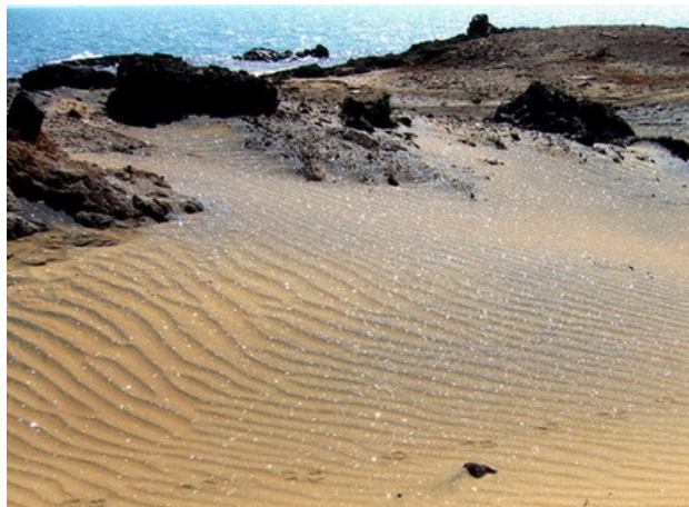
Figure 10. Ripple marks of seashore covered with oligite mineral.