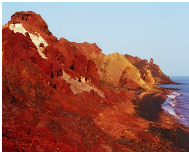
Figure 12. The area where native habitants of the region use its soil for food.