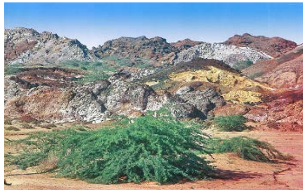
Figure 9. Colourful mountainous seashores of Hormoz Island.