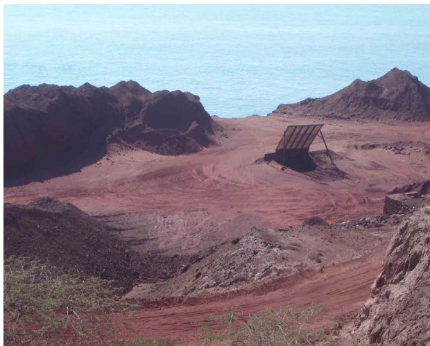
Figure 11. A layout of ochre mine of Hormoz Island.