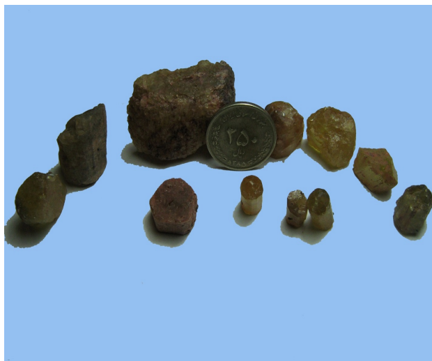
Figure 17. A sample Apatite in Hormoz Island.