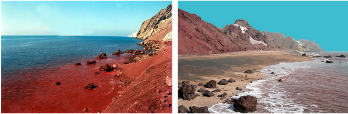
Figure 8. Red seashore around Hormoz ochre/red soil mine.