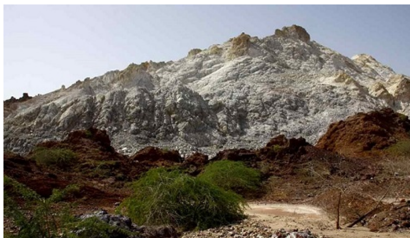
Figure 3. An overview of Trakyt-Riolite mass of Hormoz Island.