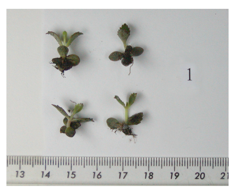
Figure 4. Buds (1) visible formed new leaves (shaking of water leads to the growth of plants).

V. I. Vernadsky called the mineral water as a creator of landscape and processes on the planet. Movement of water to create products that affect the physical properties, gives life, heals, nurtures, creates geological masterpieces, mountains and continents, and mighty rivers in the rocks, the threat of a tsunami, move the continents, currents that regulate the planet's climate. The role of water and its movement in geological processes is huge. In [9] [10] [11] observed the constancy of the H_2O_2 content in rain waters from different areas of the US with all sorts of atmospheric composition with significant differences in content