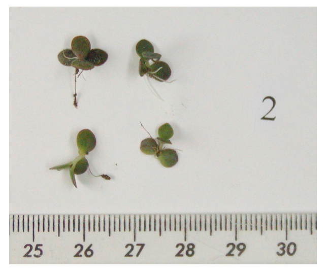
Figure 5. Buds (2) of Kalanchoe-control experience. Water without shaking.