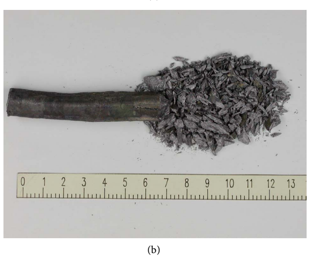
Figure 3. (a) polycrystal \beta Sn; (b) left half of the same sample under ice became a monocrystal aSn. Then ice was removed and the remaining part of the sample form became polycrystal of aSn (B, right half).