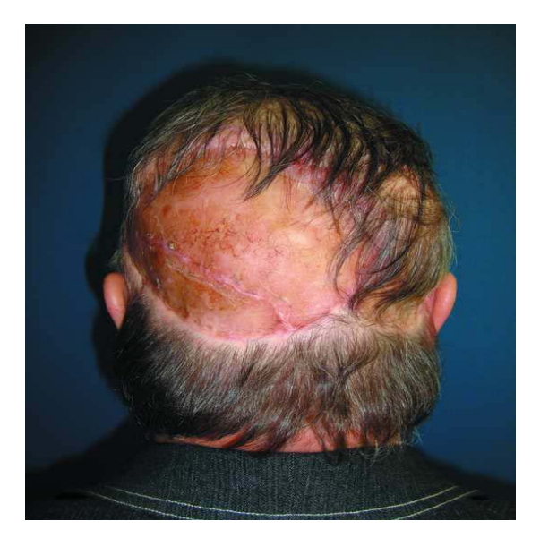
Figure 3. Postoperative photograph of the patient.