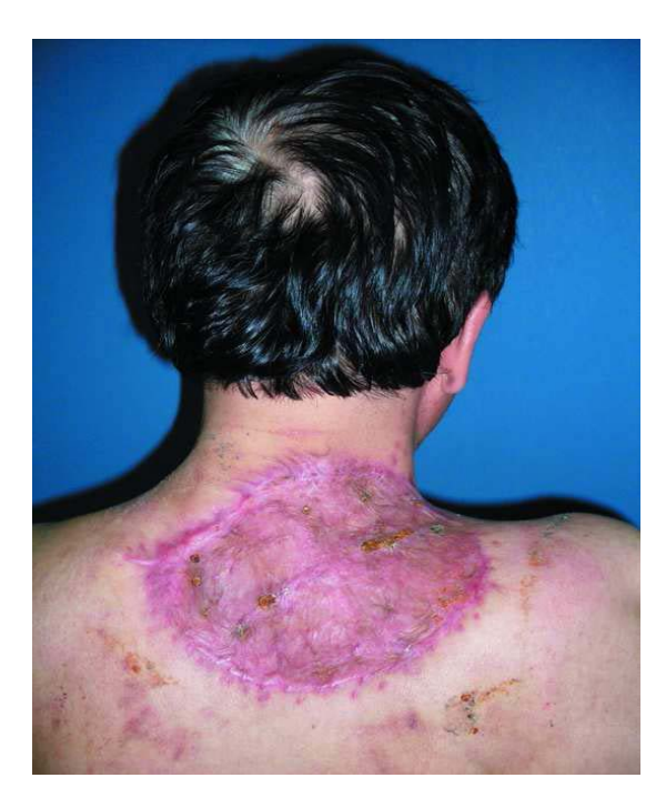
Figure 6. Photograph of the patient in 10-month follow-up.