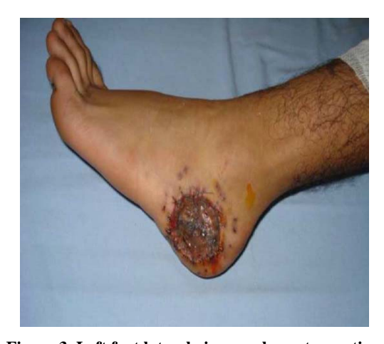
Figure 3. Left foot lateral view: early postoperative.

origin from fibroblastic cells with the ability to differentiate into myofibroblasts and a tendency to recruit histiocytic cells is postulated. It is generally accepted that myxoid neurothekeoma is a tumor of neural origin and cellular neurothekeoma is a tumor of neuroectodermal origin. However, the histogenesis of cellular neurothekeoma has not yet been fully elucidated, the tumor cells of myxoid neurothekeoma were shown to be S-100-positive; however, those of the cellular neurothekeoma