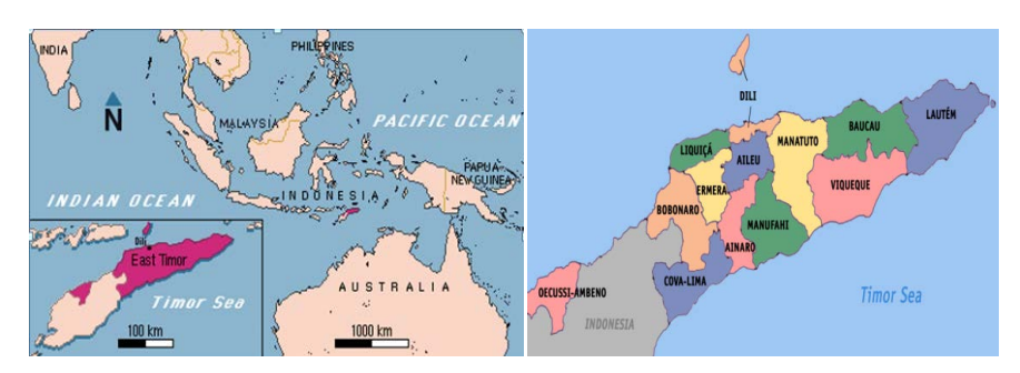
Figure 1. Location of the study.

The data were analyzed 1) descriptive qualitatively to identify the pattern of the partnership between farmers and the CCT in the forms of rights and obligations for both parties; and 2) using the Revealed Comparative Advantage (RCA)