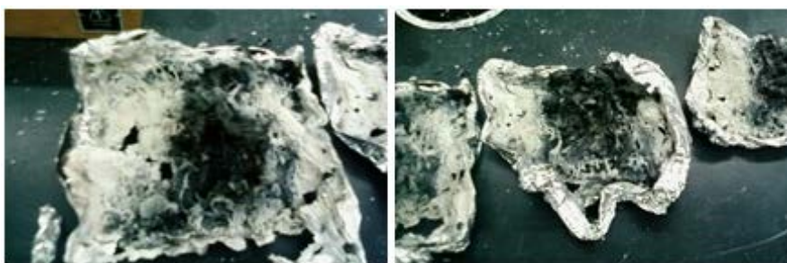
Figure 4. Sample after exposed to fire and ignition (after test).

Samples with higher wool ratios give more released heat because the wool is inflammable and therefore the heat starts from it at the moment of ignition. In case of synthetic fibers, it does not ignite at the moment of exposure to flame, but takes time until its melting, which helps it to continue its ignition and therefore does not release the heat from the moment of exposure to flame.