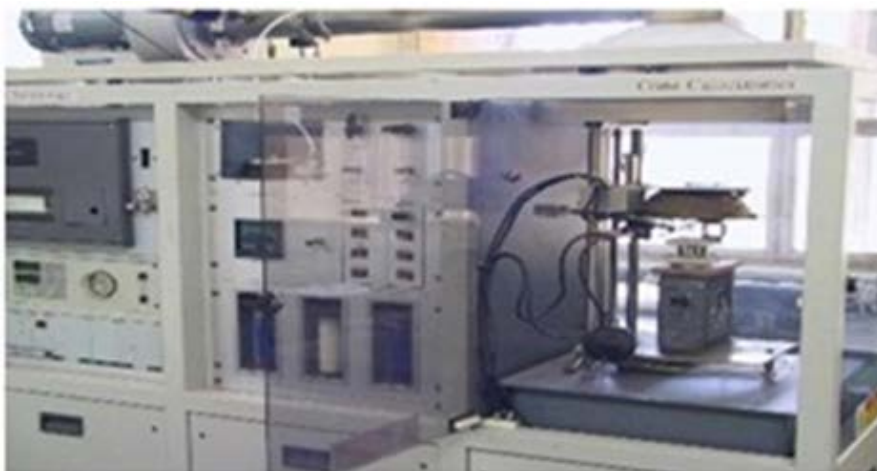
Figure 1. Cone calorimeter device.

density of the smoke emitted from the tested samples is also measured using laser technology. The cone calorimeter can isolate the different emissions automatically to analyze their amounts and percentages independently. The system uses also CO and CO 2 gas analyzer (model Ultramat 22) to determine the percentage of the toxic gases.