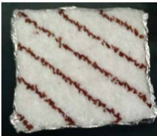
Figure 3. Sample in the ordinary case (before test).