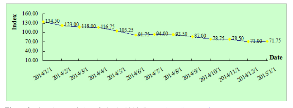
Figure 2. Platts iron ore index of 62% in 2014.