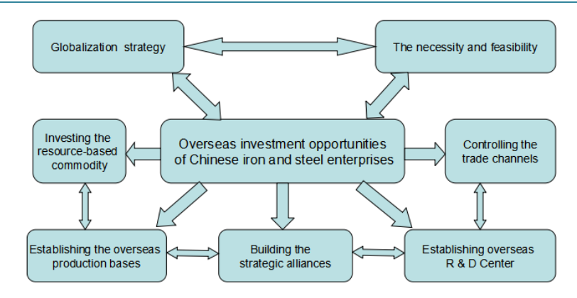
Figure 4. The implementation frame of globalization strategy.

the investment opportunities, the enterprises can comprehensively consider the investment opportunities and future development prospects in overseas investment decisions, in order to achieve the strategic goal of globalization.