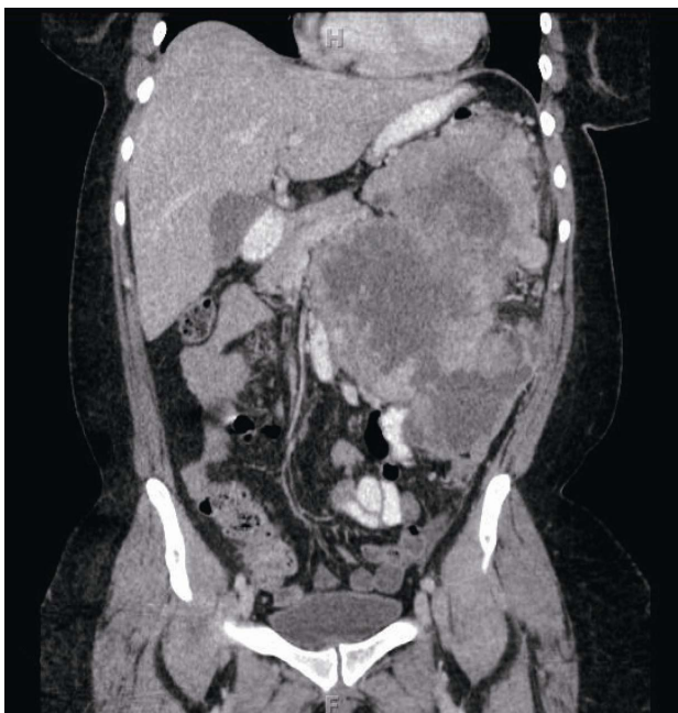
Figure 2. Coronal CT scan demonstrating a large heterogeneous mass with central necrosis in the left abdomen, involving surrounding structures.

spindle cell neoplasm. An exploratory laparotomy revealed a large necrotic ruptured malignant appearing neoplasm. This was resected en bloc with the descending colon, the omentum, the distal pancreas, the spleen, and the distal duodenum (D4). Post operative course was uncomplicated.