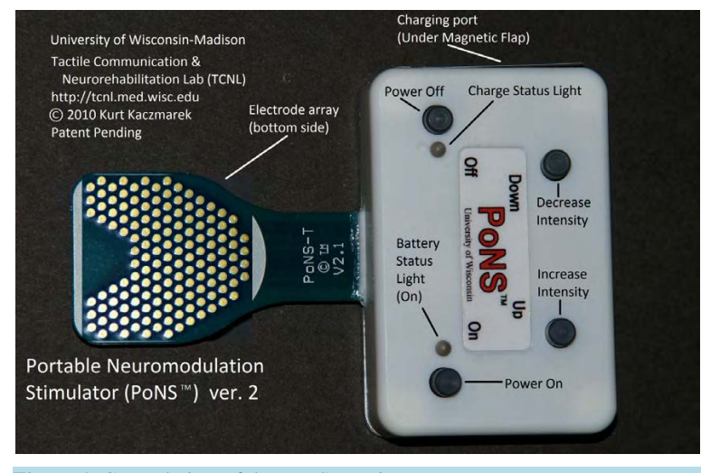
Figure 1. General view of the PoNS<sup>™</sup> unit.

The device is easily held at the place by the lips and teeth around the neck of the tab that goes into the mouth and rests on the anterior superior part of the tongue. The paddle-shaped tab of the device has a hexagonally patterned array of 143 gold-plated circular electrodes (1.50 mm diameter, on 2.34 mm centers). The array is created by a photolithographic process used to make printed circuit boards. It uses low-level electrical current to stimulate the lingual branch projections of at least two cranial nerves in the tongue anterior through the gold-plated elec-