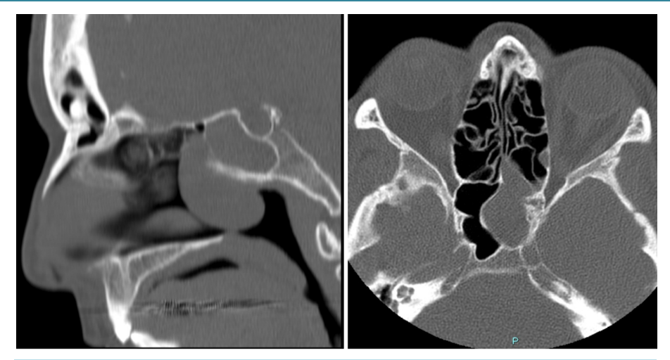
Figure 1. A 55-year-old woman with NGH in the sphenoid sinus: Axial and Sagittal CT scan shows a well-demarcated soft-tissue mass, which is extending into nasal cavity/post-nasal space.