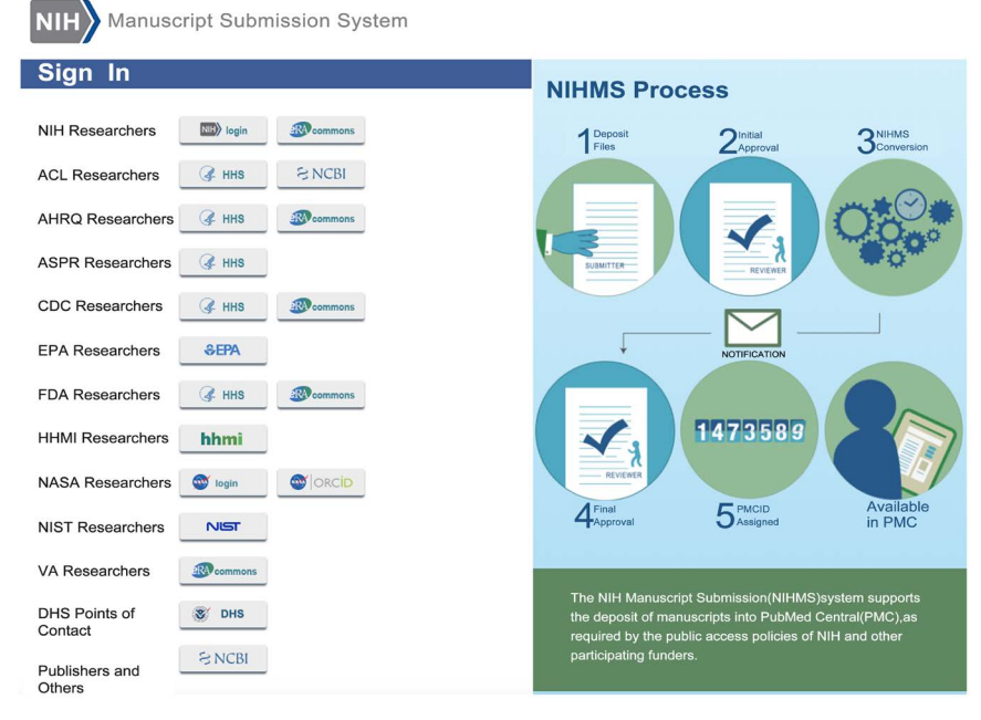
Figure 2. NIH manuscript submission process (screenshot of the NIHMS).