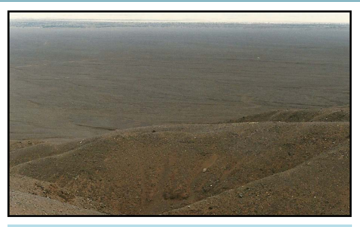
Figure 2. A northward view from the southern border of Dasht-e Lut.

area remains humid for the rest of the year. Summer temperatures rarely exceed 29°C. Annual precipitation is 680 mm in the eastern part of the plain and more than 1700 mm in the western part.