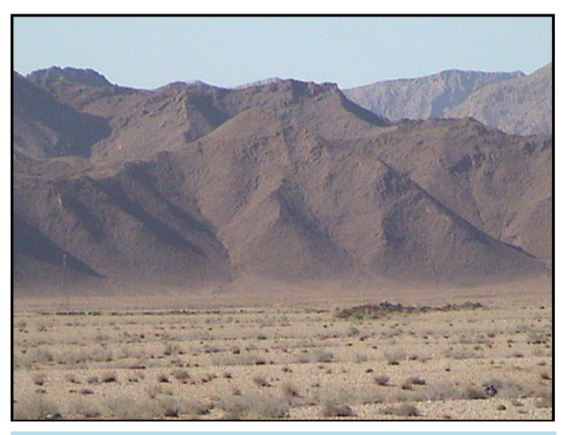
Figure 1. A northward view from the northern border of Dasht-e Kavir.

Iran's climate ranges from arid or semiarid, to subtropical along the Caspian coast and the northern forests. On the northern edge of the country (the Caspian coastal plain) temperatures rarely fall below freezing and the