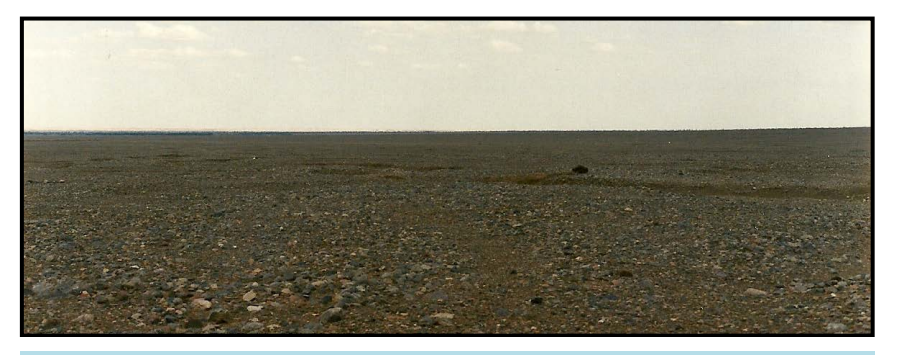
Figure 3. An eastward view from Jazmourian basin.

Volcanic and turbidities successions of Eocene, Lower Red, Qom and Upper Red Formations are common bedrocks in central Iran basins [82]. This succession is commonly overlain in the Dasht-e Kavir basin by Quaternary terrestrial clastics. But in the Jazmourian (Figure 3) and Dasht-e Lut basins, a volcanic and turbidities succession of Eocene is commonly overlain by Quaternary terrestrial clastics. It means that, the last marine conditions in the Dasht-e Kavir (A in Figure 4), Dasht-e Lut (B in Figure 4) and Jazmourian basins (C in Figure 4) has been overlain by these alluvium deposits (Quaternary terrestrial clastics).