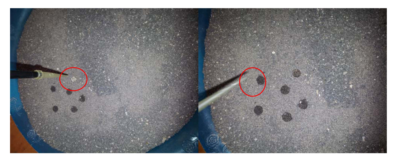
Figure 1. Water drop penetration, left photo shows water drop at time zero, right photo shows penetrated drop.