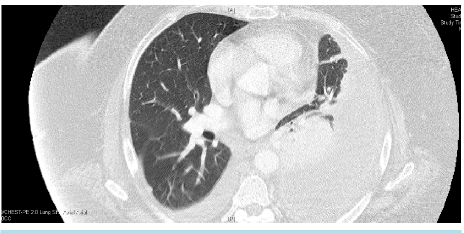
Figure 1. Large left sided pleural effusion with small right sided effusion.

A 62-year-old male hundred pack year smoking history presented with acute onset left lower quadrant abdominal pain and diarrhea. Three weeks prior to presentation, he had similar pain in the right lower quadrant and was treated for acute diverticulitis with ten days of antibiotics. Other co-morbidities included COPD, atrial fibrillation, congestive heart failure, coronary artery disease s/p multiple PCI, diabetes and chronic kidney disease. He did not report any history of peripheral vascular disease. His vital signs were stable on examination and his overall physical exam was non-focal except mild tenderness in the left lower quadrant of the abdomen without guarding or rebound tenderness. CT abdomen showed 4 cm soft tissue attenuation anterior to the L3 vertebral body in the retroaortic region suspicious for mycotic aneurysm of the abdominal aorta (Figure 2 and Figure 3).