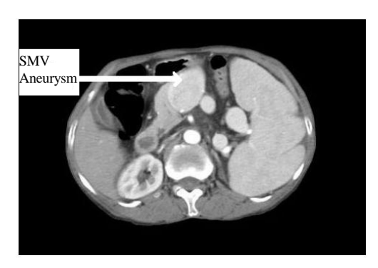
Figure 1. Axial section of CT scan shows a dilated (3.5 cm AP diameter) superior mesenteric vein without internal thrombosis.

A complex process of involution and interconnection of these vitelline veins results in the portal vein. Abnormal development of the portal venous system during this critical period may give rise to an extrahepatic portal vein aneurysm. Incomplete regression of the distal right primitive vitelline vein, or a variant branching pattern of the portal vein may later form a portal vein aneurysm. Incomplete regression of the distal right vitelline vein leads to a diverticulum that would develop into an aneurysm in the proximal superior mesenteric vein [3]. A third possible etiology could be the weakening of the