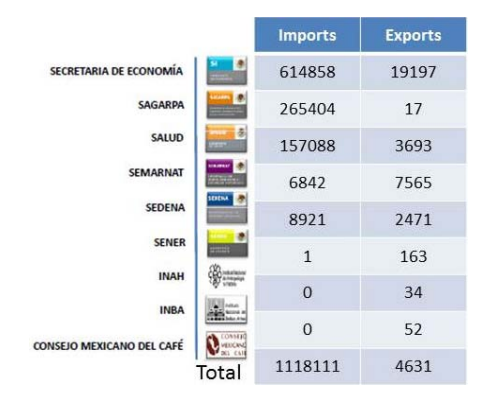
Figure 2. Permits issues by government agencies.

According to the Doing Business report most of the delays in the import export process are due to the time take it in the documents preparation. Until the year 2011 the days take in Mexico to prepare the paperwork were 14 days to exports and 17 days to imports with an average cost of 1470USD and 2050USD respectively [19]. One of the targets of the implementation of the ITSW in Mexico was to reduce the delays and costs in these parts of the process, in order to facilitate and accelerate the preparation of the governmental paper, and the interconnection between private sector windows (transport services and financial entities among others). Therefore one of the objectives of the implementation of ITSW was to place Mexico from the 74<sup>th</sup> at the 54<sup>th</sup> in the Trade Facilitation World Bank Index [18].