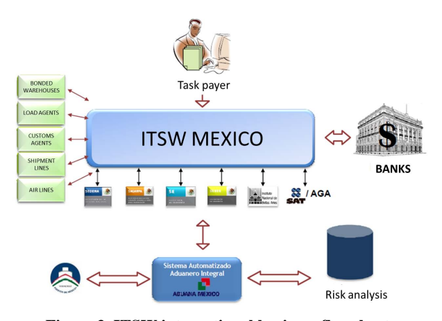
Figure 3. ITSW international business flowchart.

The first results shows that with the ITSW implementation the time in customs clearance procedures decrease in 20%, even when hasn't been completed the digitization process of the import/export proceedings.