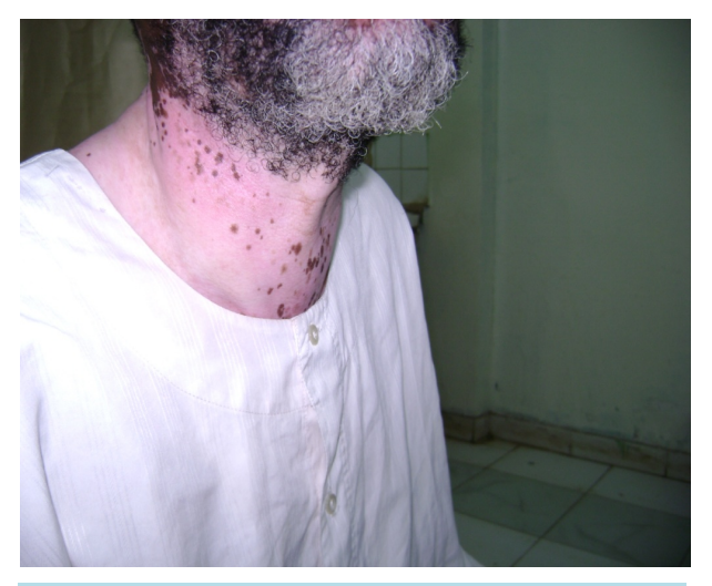
Figure 15. Slow response to treatment.