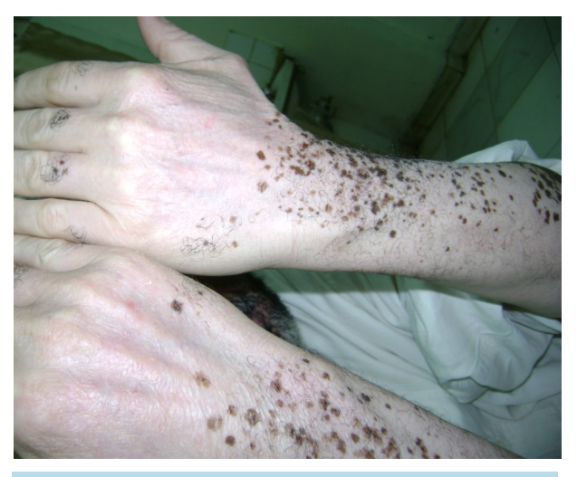
Figure 17. Generalised vitiligo after one month with Oxabet treatment.