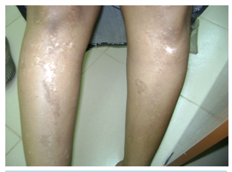
Figure 7. adult female group A after three months of treatment with Oxabet formula had completely healing.