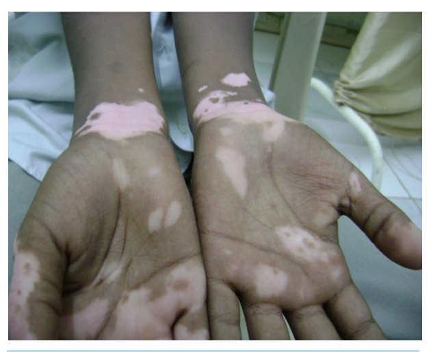
Figure 13. Acral vitiligo partially repigmented with Oxabet and UVB.