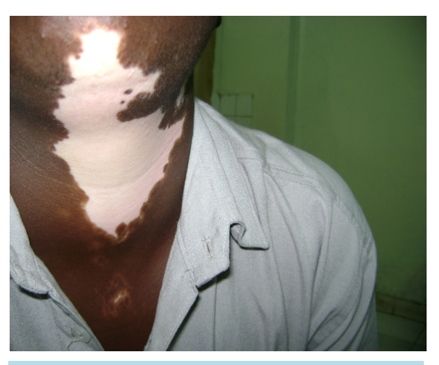
Figure 18. Focal vitiligo resistant to treatment with Oxabet.