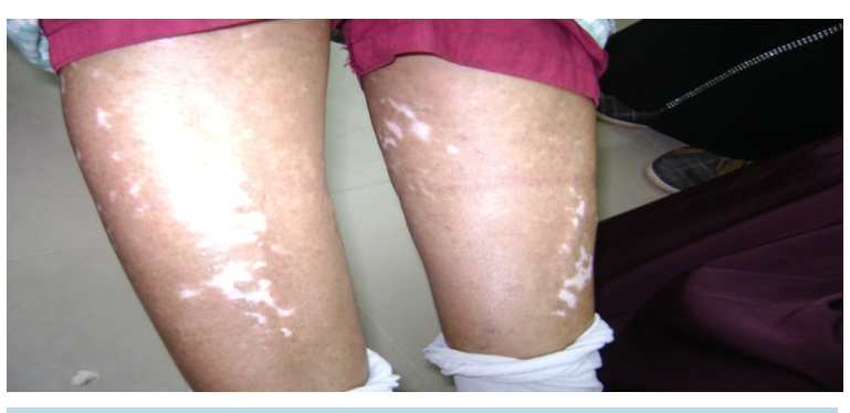
Figure 1. Lower limbs before treatment with Oxabet formula plus UVB NB 311 nm.