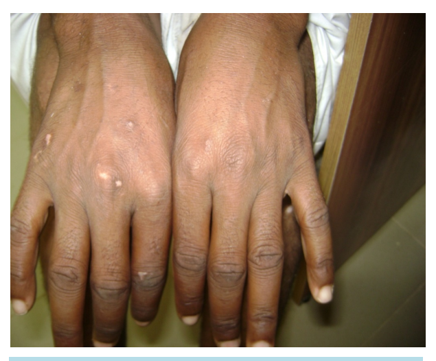
Figure 11. Acral Vitiligo, adult male group A after three months of treatment with Oxabet formula had complete healing.