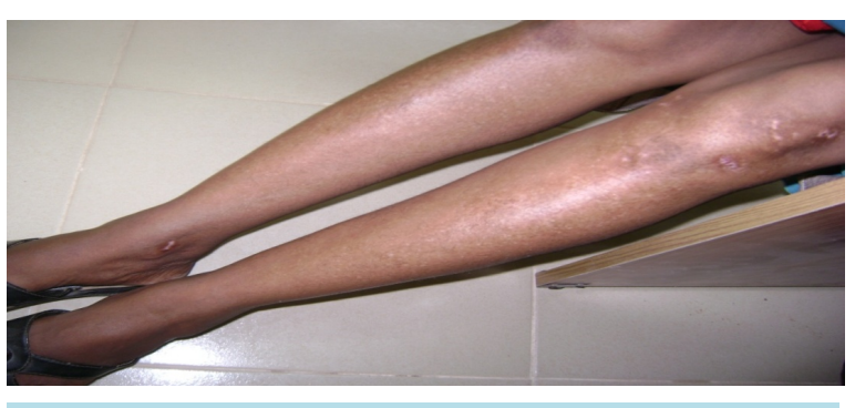
Figure 3. Lower limbs after three months of treatment with Oxabet formula plus UVB NB 311 nm had completely healing.

20 of them had complete healing, and 15 of them had good improvement (see Figures 14-18)). The children treated with formula as group A and gave results as follows: