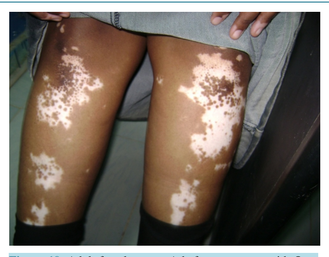
Figure 19. Adult female group A before treatment with Oxabet formula.