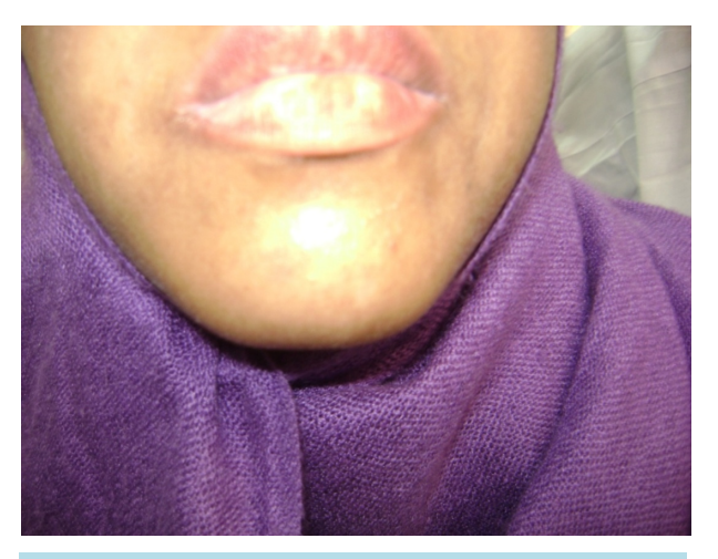
Figure 5. A child group A after three months of treatment with Oxabet formula plus UVB NB 311 nm had improvement.