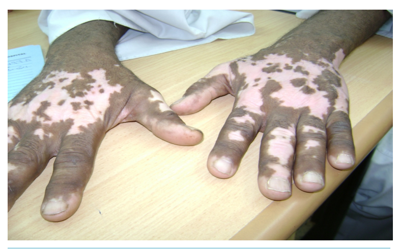
Figure 8. Acral vitiligo, adult male group A before treatment with Oxabet formula.