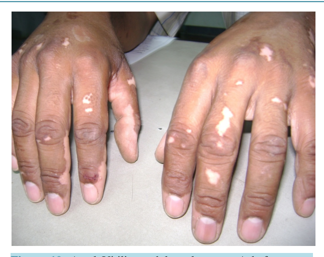
Figure 10. Acral Vitiligo, adult male group A before treatment with Oxabet formula.