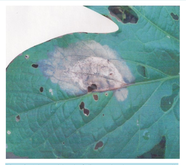
Plate 2. Advanced level of disease development on Roselle leaf showing bleached surface area.