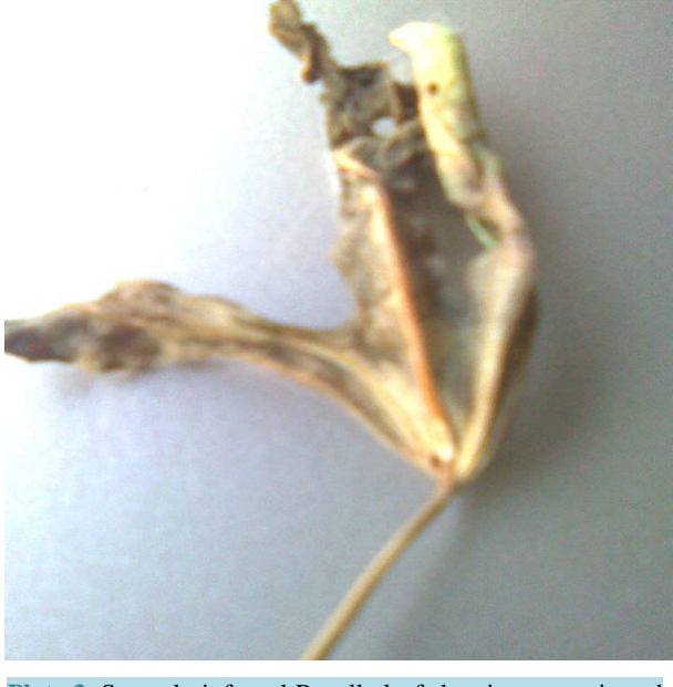
Plate 3. Severely infected Roselle leaf showing necrosis and distortion.

friendly measures. The use of cow dung as bio-fertilizer and bio-control has been on for quite some time [8]. The choice of these bio-fertilizers was based on the findings of Basak, Lee and Lee [9] who reported cow dung as being very effective in controlling Fusarium Wilt of cucumber. Also Basak, Lee and Lee [10] reported a 75% inhibition of mycelia growth of Screrotinia sclerotiorum , a fungal pathogen causing Sclerotinia rots of many vegetable crops including cucumber. The control noticed is as a result of the antagonistic action of the microbes that are contained in the cow dung [11]. Swan and Ray [12] reported that Bacillus substlis strains from cow dung inhibited the in vitro growth of Fusarium oxysporium and Botryodiplodia theobromae , the causal agents of rots in yam tuber.