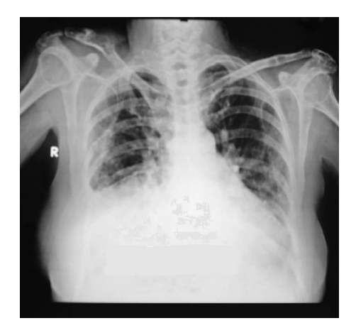
Figure 1. X-ray of chest on admission showing widespread consolidations.

The case was discussed with cardiothoracic surgeons at nearby tertiary referral center and the explanation behind persisting pneumothorax was relatively stiff lungs patient had due to consolidations secondary to chest infection. They also advised to put chest drain under negative suction pressure of -1 KPa (kilo pascals).