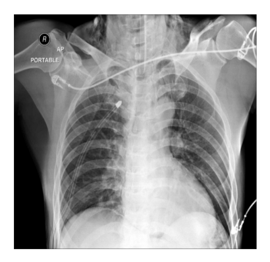
Figure 3. X-ray done after chest drain insertion showed residual pneumothorax on the right side.