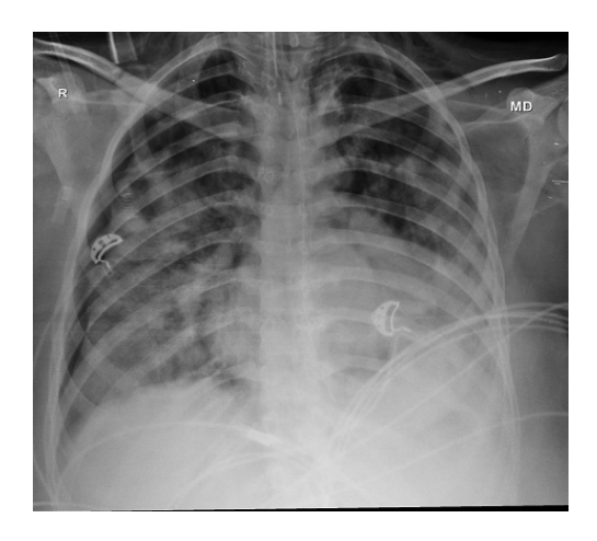
Figure 2. X-ray chest done on Day 3 showing a right-sided pneumothorax.