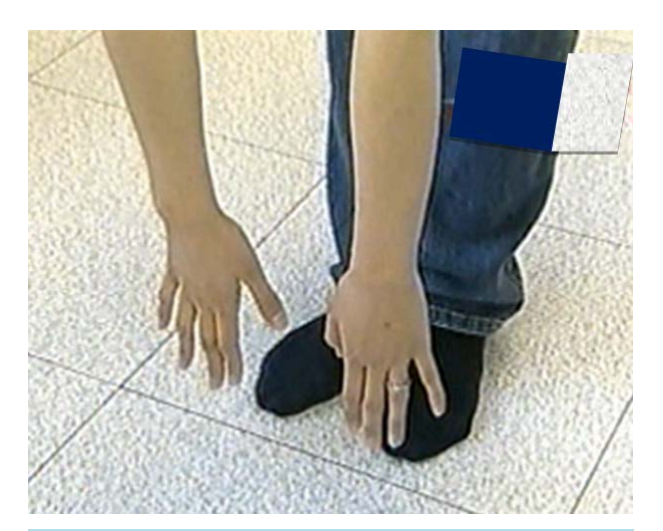
Figure 1. The subject could not bend forward and touch the floor with her fingers. The distance between the floor and her fingertips was approximately 5 cm.

The sharp buccal surface of the left lower second molar was considered to be harmfully stimulating the buccal