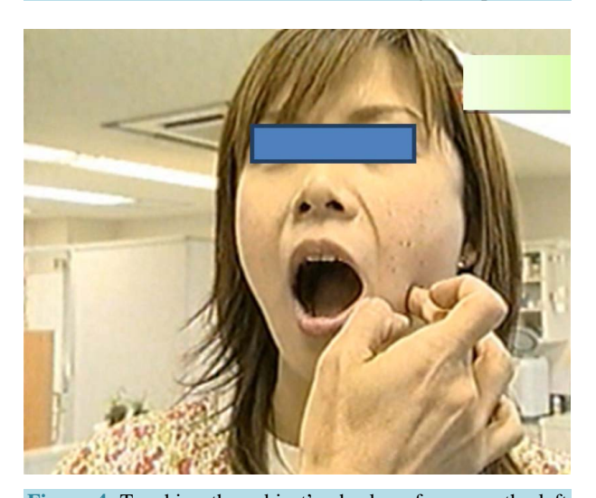
Figure 4. Touching the subject's cheek surface over the left lower second molar led to a decrease in grasping power.

membrane: thus it was smoothened ( Figure 5 , Figure 6 ). Soon after this simple procedure, the subject was able to touch the floor with her fingertips with ease ( Figure 7 ), and no longer felt pain when she leaned backwards. When performing BDORT, her grasping power did not decrease (O-ring closed) when she leaned backwards or when the center of her back was stimulated by a chopstick. The effectiveness of this treatment continued for over a year.