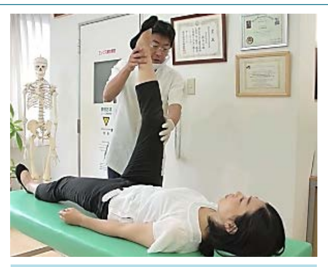
Figure 13. The subject did not feel any tension or pain when a right leg SLR (Straight Leg Raising) test was performed after the treatment. The subject's right leg was able to be lifted up to an angle of approximately 90 degrees.

with balance dysregulation while opening of the mouth results in stretching and pulling of the mucous membrane inwards. The mucous membrane may have been stimulated by the buccal surface. This may also explain the occurrence of the same symptoms when pressure was applied to the subject's cheek. Balance dysregulation due to the stimulation of the buccal mucosa may have been the cause of lumbago in Case 2. The O-ring was easily opened in almost all cases including present two cases when balance dysregulation occurred. However, the mechanism by which this occurs is still unclear. The author thinks that there may be areas like "reflective areas" of reflexology [14]. The harmful stimulation of these areas in the mucous membrane may affect the brain, resulting in this phenomenon. In several patients, the cause of lumbago is unknown. This study provides evidence that dental issues may be one of the causes of this condition that can be treated effectively. Academic cooperation between the dental and medical fields will aid in a better understanding of this phenomenon. Further evidence is required to spread out this treatment widely.