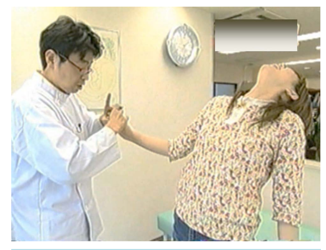
Figure 2. The subject presented with a decrease in grasping power while leaning backwards. So, her O-ring opened.