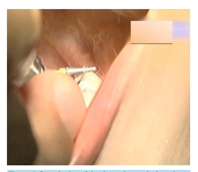
Figure 6. Smoothening of the sharp edge on the buccal surface of the lower left molar.