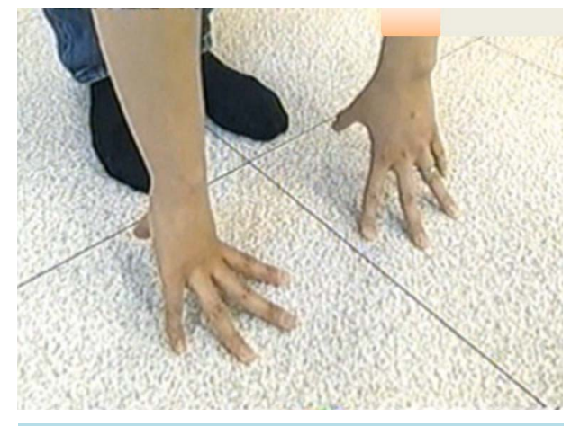
Figure 7. Soon after this simple treatment, the subject could easily bend forward and touch the floor with her fingertips.