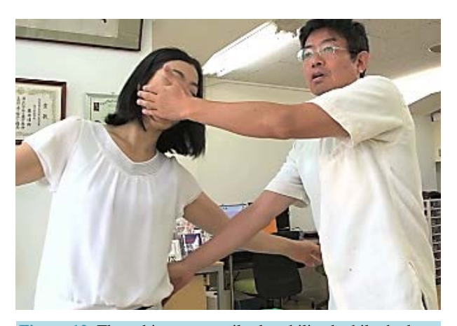
Figure 12. The subject was easily destabilized while the lower portion of her upper cheek was pushed.

Moreover, the subject was easily destabilized when the author inserted his finger into the subject's mouth between the right lower second molar and the buccal mucosa.