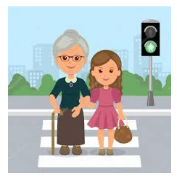
Figure 11. Photograph showing comfortable pathway for walking.