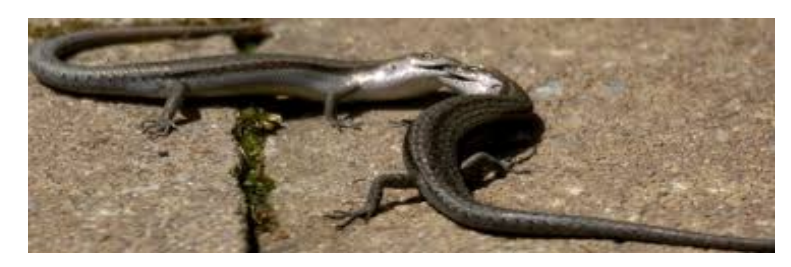
Figure 13. Photograph showing laying lizards with unpredictable health status.