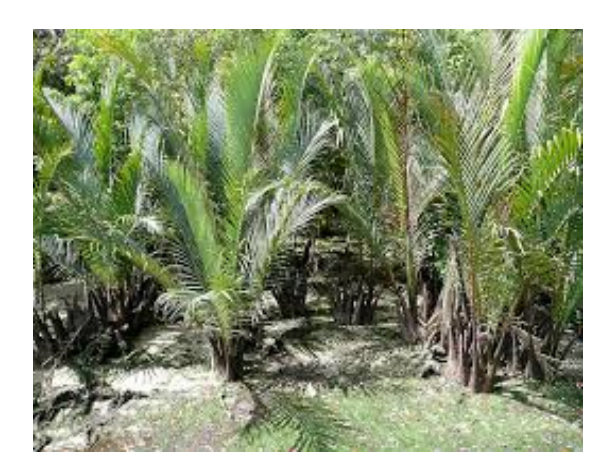
Figure 2. Cross-section of Nipa palms showing disorder in unhealthy competition.

The sight of a fertile land with a luxuriant growth of crops as shown in Figure 3 , gives so much joy to the farmer that he anticipates harvest and post-harvest activities, including eating in abundance. Similarly, identification of appropriate technologies for a particular soil condition and combinations of soil conditions to apply give hope to soil scientists and the world at large. The Igbos believe in soil resource and that the sight of a fertile soil especially one with growing healthy crops gives hope to a hungry farmer who in turn prepares his stomach in anticipation. The proverb emphasizes that if preconditions to anything are met, the next step(s) unfolds retorted Nwogu (Nwogu, 2018). Life has an order that a particular action begets the next.