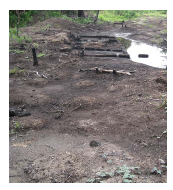
Figure 7. Photograph showing a parched land incapable of growing crops.