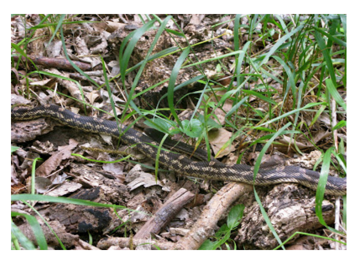
Figure 9. Photograph showing unkempt farmland.

about the consequences of soil degradation. Such degradation may puncture soil security which was defined by Global soil security (Global Soil Security, 2018) as the maintenance and improvement of the world's soil resource to produce food, fibre and fresh water, while also contributing to energy and climate stability, maintaining biodiversity and protecting natural systems and human wellbeing more generally. Safeguarding the health and wellbeing of current and future generations through good stewardship of Earth's natural systems, and by re-thinking the way we feed, move, house, power and care for the world constitutes world health.