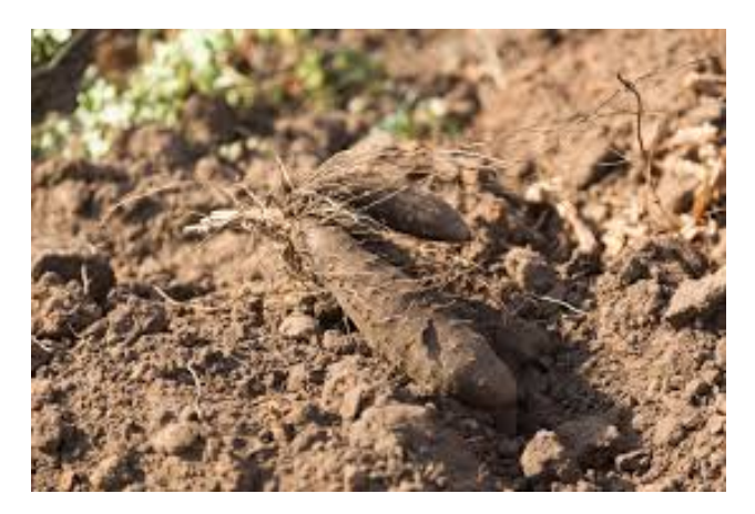
Figure 5. Photograph showing rich soil and rich harvest.