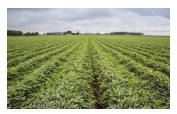
Figure 3. Photograph of a promising fertile land with healthy crops.