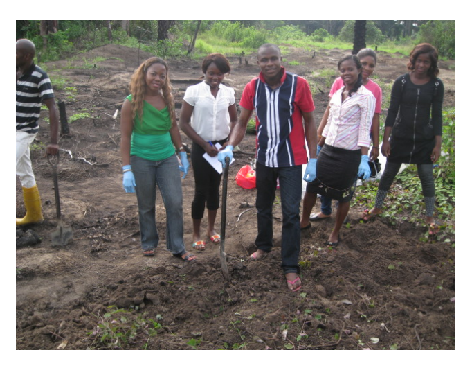
Figure 4. Photograph showing prepared team for cultivation on a farmland.