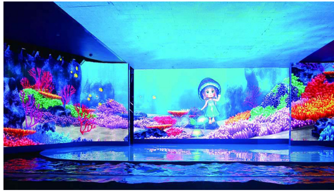
Figure 2. Choreography visual creativity using decorative-type digital animation.