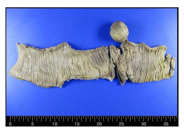
Figure 2. The resected ileum with an inflammatory fibroid polyp. This submucosal polypoid mass measured approximately 4.5 \times 4.0 cm.