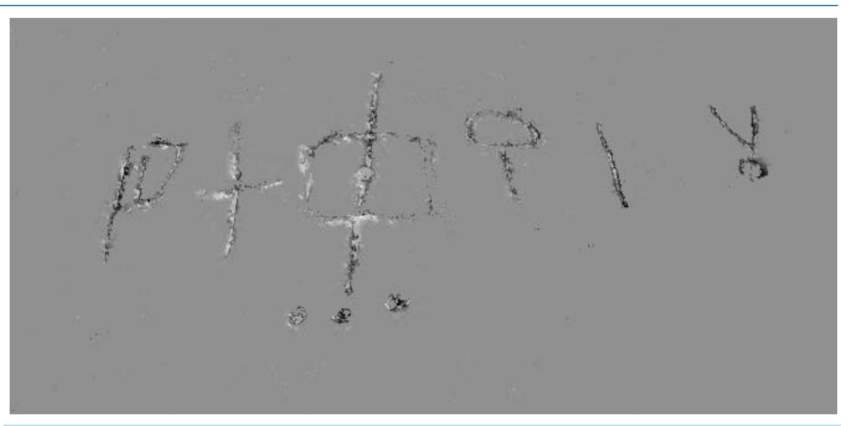
Figure 2. Layout of the inscription of Parvomai.