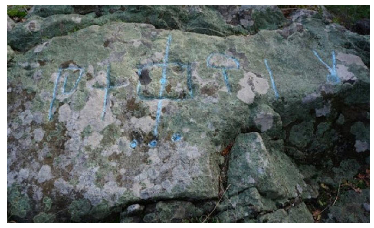
Figure 1. Rock hosting the inscription of Parvomai.

The first character of the inscription corresponds perfectly to a character of the inscription on the plate of Gradeshnitsa dated to the 5<sup>th</sup> millennium BC. The second character corresponds to a character on an artifact from Valchi Dol dated to the 5<sup>th</sup> millennium BC. This character can be found also among the characters of the Magura cave, which according to some researchers could be dated to the 5<sup>th</sup> millennium BC. The third character