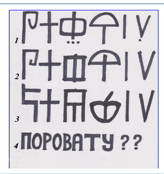
Figure 4. Similarities between the characters of the: 1, Parvomai inscription, 2, Danubianstyle and Balkan style scripts, 3, Linear A and Linear B scripts, 4, sound values of the characters of the Parvomai inscription based on the sound values of the Linear A and Linear B scripts, the sound values of the last two characters remain unknown.

probably due to influences of these South Balkan or Danubian cultures on the Aegean and Mediterranean cultures. This hypothesis is particularly important because it permit to give sound values to the characters in the inscription of Parvomai (Figure 4).