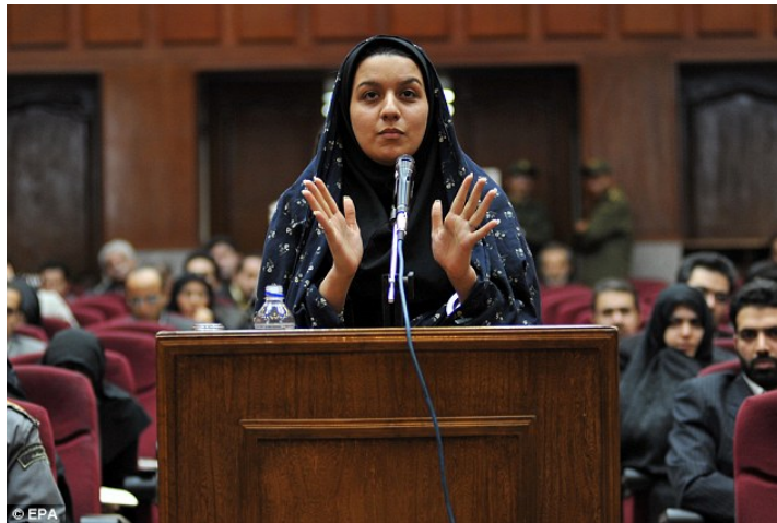
Figure 8. Reyhaneh Jabbari addressing the court before her execution despite Human Rights organizations appeal for clemency.