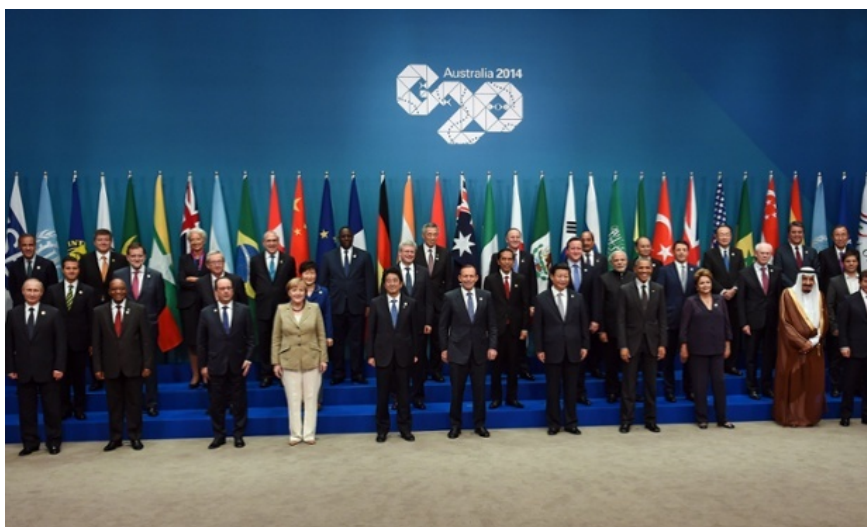
Figure 15. On the left of the group photograph is President Putin derogatorily placed on the outer edge for the formal G20 leaders photograph.