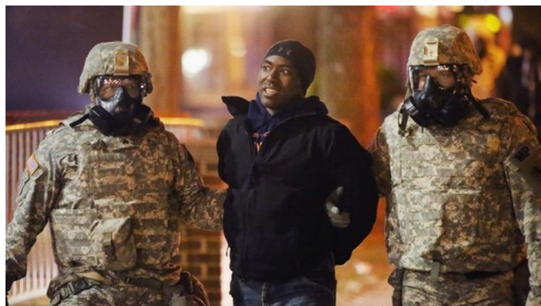
Figure 11. United Nations depiction of black racial profiling (News Sections, 2014r).

Justifying the pre-eminence of unipolar world and it head, USA, Ban Ki-Moon, United Nations’ Secretary-General, recently blasted some world leaders for their poor response to Ebola epidemic. Here him, “... The same cannot be said of others among the world’s most influential countries, whose miserly and irresponsible reaction to the epidemic belies their claims to the 21st century global leadership” (Tisdall, 2014). This is a tacit reference to China in particular whose paltry $38 million and later additional $16 contribution to Ebola finance solution is damnable given its huge investments in Africa and more importantly being “the world’s second largest economy and would be global leader with extensive commercial interest in Africa”; although, it further promised it “would help train African healthcare workers and supply medical kits and ambulances. In contrast, USA, China’s global economy rival, announced an additional $142 m in humanitarian aid, on top of its extensive previously announced, military and other multilateral assistance” (Tisdall, 2014).