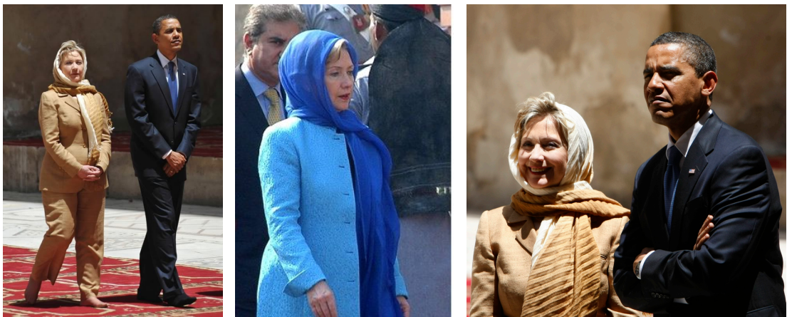
Figure 4. Hillary Clinton with President Obama on three different occasions in the Middle East.