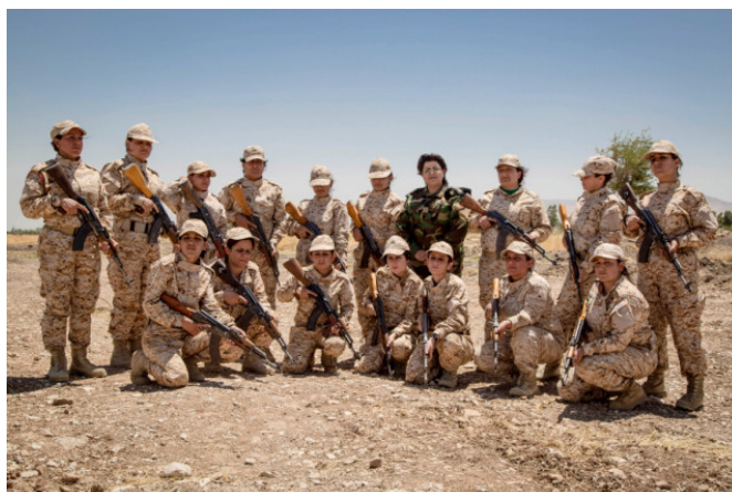
Figure 12. Female Pershmerga fighters in the ongoing Global coalition against ISIS.

In no other conflict zone is Pope Francis admonitions: "Greed, intolerance and the lust for power" as the banes of conflict all over the world more relevant than in China-Japan conflict. This is because the nations involved are not just nuclear power nations but also world economic power houses. Prior to the outbreak of Senkaku's island dispute between these two countries, there had been other conflicting issues between them. One is the "Nanjing massacre which China says 300, 000 Chinese civilians were massacred when the city was occupied by Japan's troops in 1937; though some Japanese nationalists dispute this". For the first time, China is giving this incident state commemoration which is being miss-interpreted in certain quarters. But China President Xi countered this by telling the survivors that "to deny a crime was to repeat it but insisted the ceremony was to promote peace, not to prolong it". Two, in the past, there have also been clashes between China and Japan over the latter's insistence on "honoring its war dead, including convicted war criminals, at the Yasukuni shrine" (News sections, 2014z1).