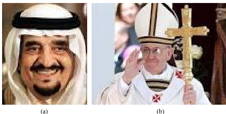
Figure 7. (a) King Fahd of Saudi Arabia; (b) Pope Francis of the Holy Sea.

Defining “two-state solution”, the new Prime Minister of Sweden said “a two-state solution requires mutual recognition and a will to peaceful co-existence. Sweden will therefore recognize the state of Palestine. Expressing similar position, current UK government states that it “reserves the right to recognize a Palestinian state bilaterally at the moment of our choosing and when it can best help bring about peace”. Following UK in passing