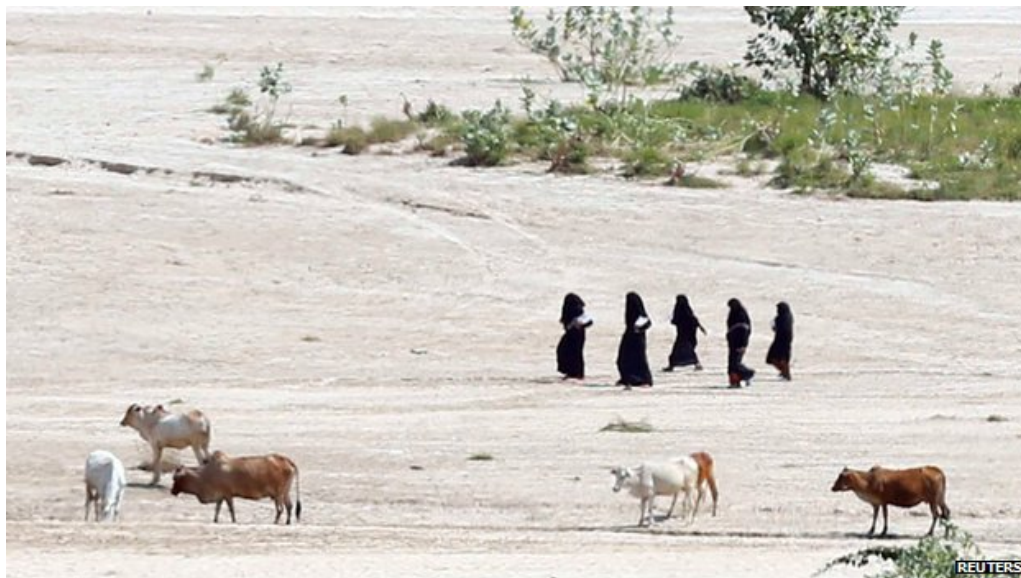
Figure 2. Women in conservative Yemen often pass through checkpoints without being searched. Seizing this opportunity, “several suspected al-Qaeda militants, disguised as fully veiled women, have reportedly been shot dead by Yemeni security forces near the Saudi border” (News Sections, 2014a).