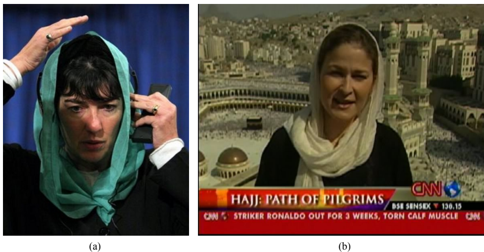
Figure 5. (a) Christiana Amanpour in Ijab; (b) Hala Gorani in Ijab.

However, there is an opportunity in the current global coalition against the ISIS or ISL, to encourage modernization in some so called repulsive Islamic doctrines. Never before has Arabian world given massive support for western nations in any campaign against any Arab country or values—Arab-Israeli war of 1967, Israeli-Palestinian war since 1948, American war against Afghanistan (operated under NATO command) 2001, American war against Iraq (operated under NATO command), 2003; Israeli-Gaza war of 2014—until the current global war against ISL. Influential Arab countries in the current global airstrike campaigns against ISIS include Bahrain, Saudi Arabia, the United Arab Emirate and Jordan. They all joined USA in air raid against Iraq and Syria. Other Arab countries presumed to be part of this coalition but are yet to properly join in the airstrike campaign are Qatar, Egypt and Turkey. Major western powers plus United States of America in this airstrike campaign include: “Britain, France, Australia, Germany, the Netherlands and recently Canada (CNN, 2014c).