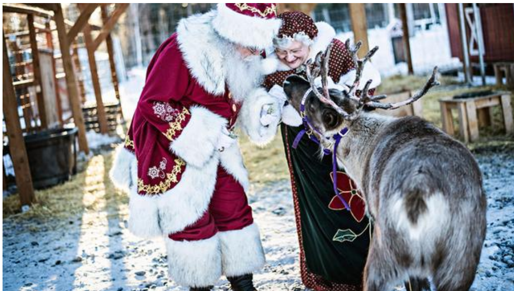
Figure 1. Living where it is perpetually Christmas poses unique challenges (Santa Claus House). This is Father Christmas in Christian form of “purdah”.