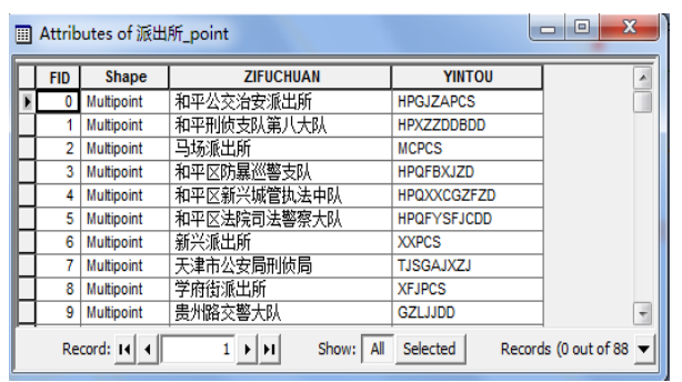
Figure 4. Attributes table

In police GIS, open the existed map Tianjin.mxd , choose the menu "CPI INQUIRY", will call the Chinese Phonetic Initial inquiry function. For example: inquiry the place name, CPIs "XYLPCS", First, choose the corresponding layer, paichusuo_point ; Second, input the CPIs "XYLPCS", only one record is listed in table, as shown in Fig. 5.