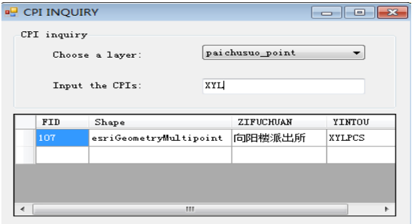
Figure 5. Inquiry result

In police GIS, open the existed map Tianjin.mxd , choose the menu "CPI INQUIRY", will call the Chinese Phonetic Initial inquiry function. For example: inquiry the place name, CPIs "XYLPCS", First, choose the corresponding layer, paichusuo_point ; Second, input the CPIs "XYLPCS", only one record is listed in table, as shown in Fig. 5.