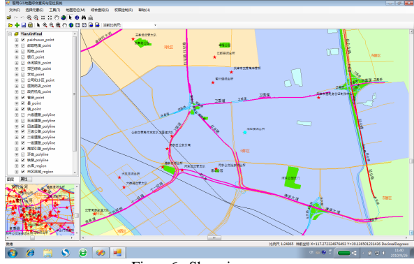
Figure 6. Show in map

Double click the record of destination name, this place will be shown in center screen and twinkle in police GIS, just as shown in Fig.6.