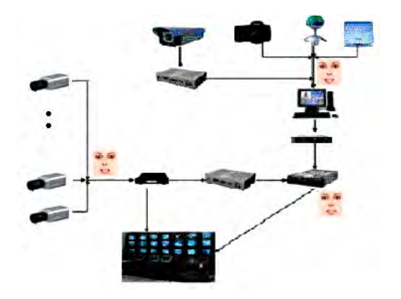
Figure 2. Face Recognition program station dispatched a monitoring plan

The entire system architecture is shown in Figure 2. In the traditional video surveillance system on top, we passed a video camera divider will be collected to monitor video transported to the sea Xin facial feature extractor, the complete human face detection, storage, record, will face images LAN submitted to the human face than on the server, and various types of special populations database comparison. Real-time comparison of the results will be displayed in the portrait than the right display. Once officers hit, the system will trigger the control room of voice alarm systems, and compared the results to write the system log. Meanwhile, in the remaining room, can be photos of the suspect object input into the monitoring database, and submit to the human face than on the server for real-time comparison, when hit, can be recognized directly by the relevant staff.