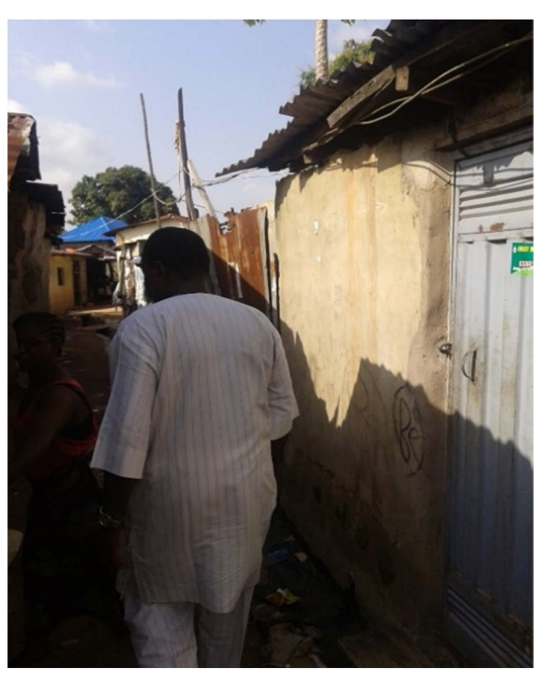
Plate 11. Utako, Abuja settlement area.