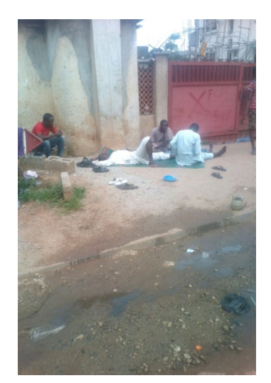
Source: Obiadi (June 2016) Plate 1. Abuja's public space (housing/shelter).

elements and qualities. The nature of the socioeconomic complexity of these informal spaces, which analysis is shown in this work, constitute a strongly identifiable character which is in this work christened Spatial Housing . It is so termed because of the assumption of the public/open space into the provision of the basic (spatial) socioeconomic, psychological, shelter, etc. needs of the urban poor.