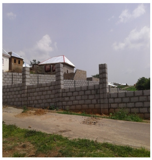
Plate 4. Guzakpe, Abuja settlement expansion.

field work, the inhabitants are outgrowing their current communities ( Plates 2-11 ). On the field, the writers noted that the settlements were overcrowded and the residents expanding the buildings. New buildings as indicated on Plate 4 and Plate 5 were common. Expansions with zink and aluminum products were equally common as shown on Plates 6-11 .