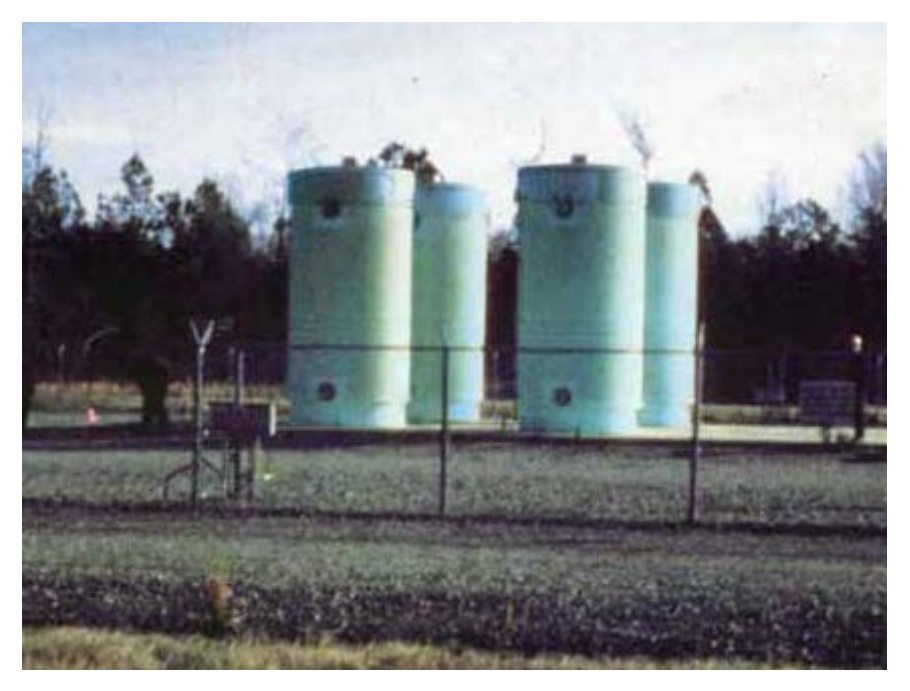
Figure 2. CASTOR V (Interim storage facility Surry).

approximately 10 GWeof total capacity of 100 year operating NPPs with reactors SVBR-100.