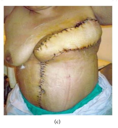
Figure 3. Left Radionecrotic ulcer treated with debridement and contralateral TRAM flap (a) preoperative view; (b) intraoperative picture after debridement and (c) post-operative picture.