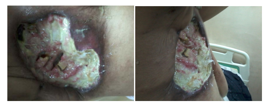
Figure 1. A 53-year-old female presented with post-mastectomy radiation-induced osteoradionecrosis.

5 patients underwent debridement and split skin graft (these patients had the ulcer limited to skin and subcutaneous only), 11 patients underwent excision of ulcer and reconstruction with myocutaneous flap. among them, 7 patients were