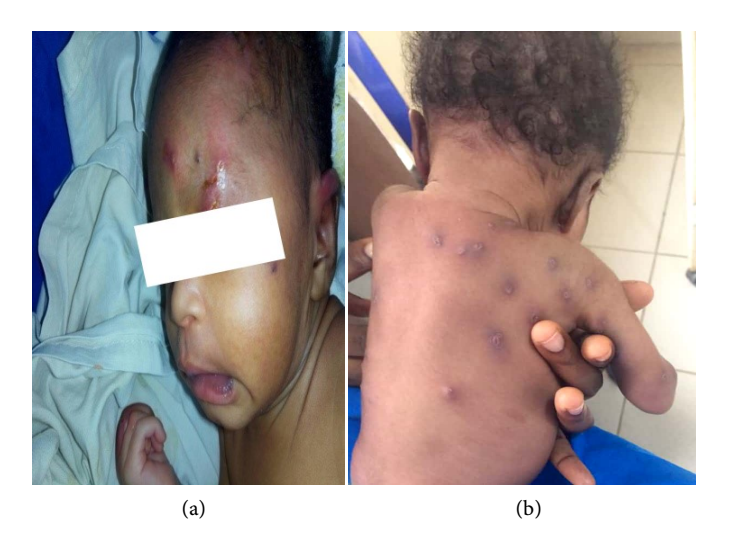
Figure 1. Photograph of the neonate showing (a) scalp and facial swellings and (b) lesions on the back.